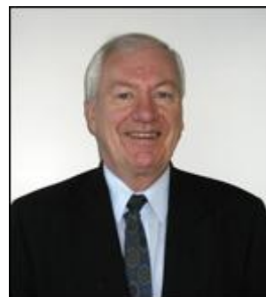
Message from Deputy Minister, Kevin McNamara

Health and Wellness coordinated translation requests from the health authorities and the IWK, contributing to a greater amount of health related publications and patient material available in French. The department also played a leading role in organizing a forum bringing together the health authorities, the IWK, and the Réseau Santé to share best practices in French-language services and capitalize on shared resources. The efforts of the DHAs and IWK are vital to promoting and enhancing French language services in the province.