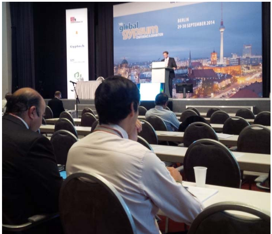
A speaker takes the stage at the Global Gypsum Conference in Berlin.