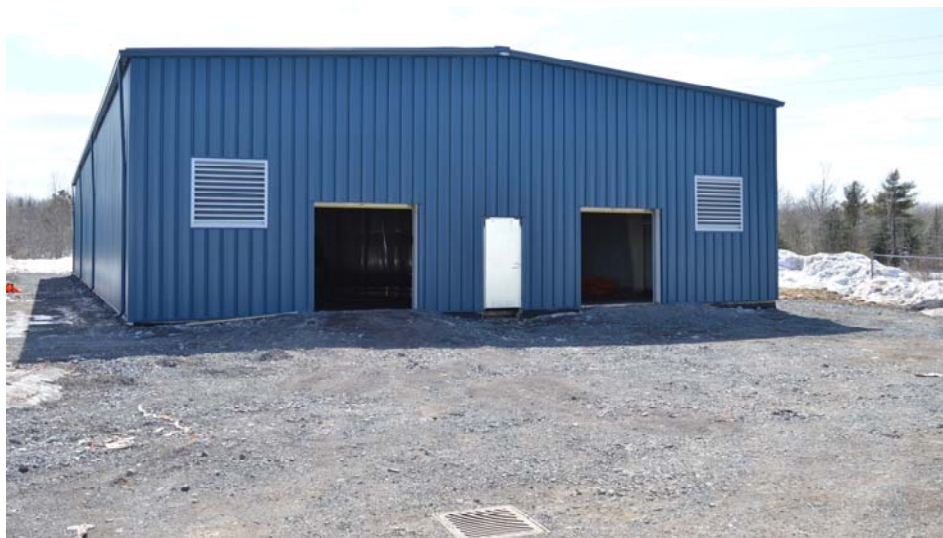
The new core building at the Stellarton Industrial Park was completed on June 15, 2015. Work is now under way to consolidate the department's holdings and put the new building into full use.