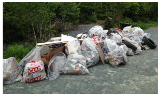
Some of the litter picked up by the Lake Echo Lions Club.