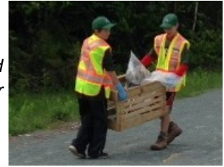
Lake Echo Lions Club (pictured at right) had a good turnout for their cleanup this year.