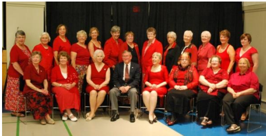
Nova Scotia Delegates