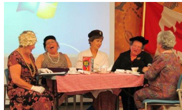
Kings West District

The Nova Scotia Community College, Truro Campus was the scene for the 2012 Women's Institutes of Nova Scotia Convention. The theme of the Convention was "99 and Counting".