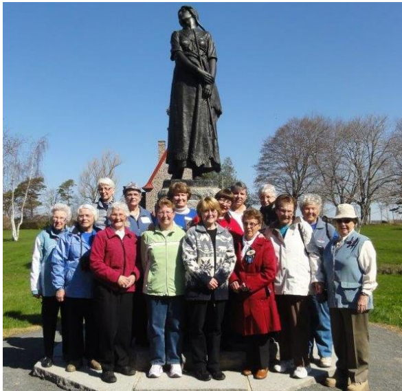
Kings West District members doing the 100 steps at Grande Pre to celebrate 100th anniversary of WI in Nova Scotia