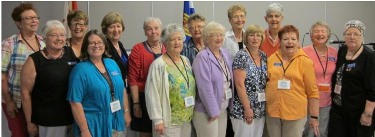
AGM 2013 New Glasgow