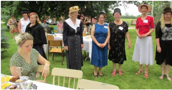
Martock Windsor-Forks had a Garden Tea Party on July 6th