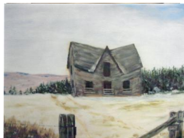
2011 – Fundraiser A painting of the Nuttby House