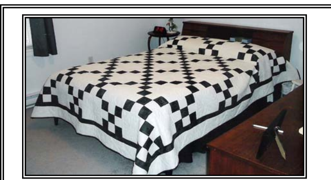
2007 Fundraiser – An Irish Chain Quilt

Also in this day roses were presented to two W.I. members who had celebrated their birthdays over the past month.