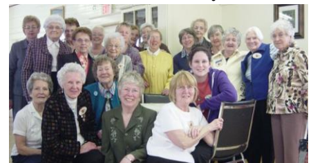
Members of South Berwick WI and members of Medford WI

Tupperville was busy during the months of November to February with