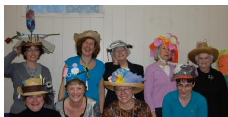
Lyon's Brook WI members with their creative hats.