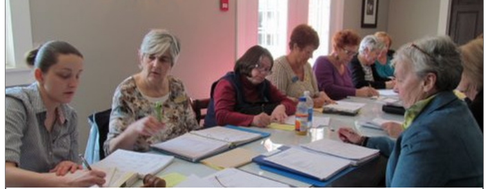
District Directors at work during the Board Meeting held April 12 & 13!