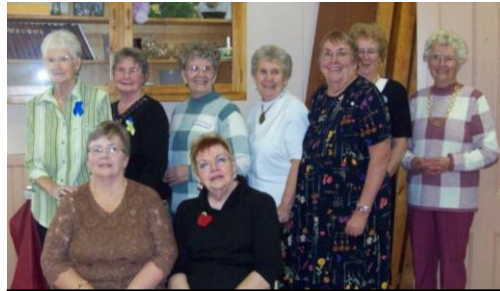
Spa Springs WI celebrates 35th Anniversary on October 17