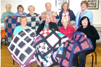
Point Edward WI members with the donation of quilt to the Talbot House.