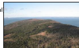
Cape Split, Kings

Turn the page for valuable information to help meet your Crown land information needs.