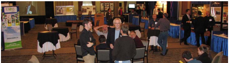
Participants enjoy a break in the poster suite during Geology Matters 2009.