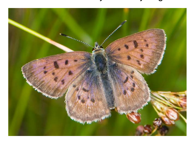
A somewhat worn-looking male SM Copper at Wallace NWA, July 26<sup>th</sup>, 2008

Salt Marsh Copper- Eight sites harbouring this species were recorded during the survey, including four new ones. These include Brulé, Emery Island, Fox Harbour and Wallace Bay National Wildlife Area. Interestingly, all sites harbouring this species were situated between the New Brunswick border and Brulé in Colchester County, strongly suggesting that this species is (still?) absent further along the coast. This is puzzling, given that apparently suitable habitat containing both the larval foodplant ( Potentilla egedii , a silverweed) and the preferred nectaring plants for the adults ( Limonium nashii , aka Sea Lavender) are available all the way to the Canso Causeway and likely beyond (Cape Breton and the Atlantic and Fundy coasts). Moreover, this species can be found at some sites such as Emery Island in very high numbers (likely in the thousands) quite far east in the study area. As mentioned briefly in the methods section, a spate of bad weather in late July and early August made sampling for adults of this