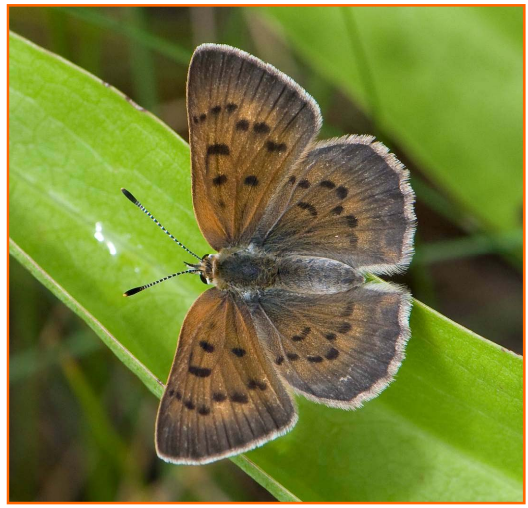
Salt Marsh Copper (Lycaena dospassosi) female, Wallace Bay NWA, July 26th, 2008

NS Species at Risk Conservation Fund Final Report, 2008 Project # NSSARCF07_04