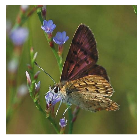
A male SM Copper nectaring on Sea Lavender at Northport, July 26<sup>th</sup>, 2008

species and the Maritime Ringlet problematical and possibly lead to some sites being recorded as not harbouring these species when they actually did. However, during the days we were present in the field, adults were flying at the control sites; therefore, it is felt that the sites recorded as negative for the SM Copper on that particularly day were likely accurate. In other words, the conclusion that this species seems to be absent in sites beyond Brulé in Colchester County is deemed to be accurate for the summer of 2008. It should also be pointed out that some butterfly experts feel that this species is actually rapidly expanding its range (cf Ross Layberry, Jim Edsall, pers. comm. 2008) and may colonize suitable habitats in the very near future, whilst others (cf R.P Webster, pers. comm. 2008) feel that this species has simply been overlooked in the past, given its habitat preference. Personally, I have seen encountered this species on roadsides in New Brunswick and Nova Scotia sometimes more than a kilometer from its most likely breeding area, therefore I am inclined to also