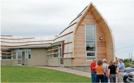
New Health Center in Pictou Landing First Nation, visited by the Mi'kmaq, Canada and Nova Scotia negotiation teams, during a site visit in July 2007.