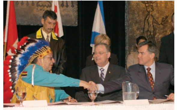
Framework Agreement Signing Ceremony in Membertou First Nation, February 23, 2007.

Moose management in the Cape Breton Highlands was one of the early topics raised in the Made-in-Nova Scotia Process. Moose became locally extinct in Cape Breton in the late 1800s, and were re-introduced in 1948-49 to the newly established Cape Breton Highlands National Park with 18 animals from Elk Island National Park, Alberta. This new moose population grew to the point that by the mid 1980's they could be sustainably hunted in areas outside the park. The Government of Nova Scotia has permitted an annual licensed limited entry hunt since 1986.