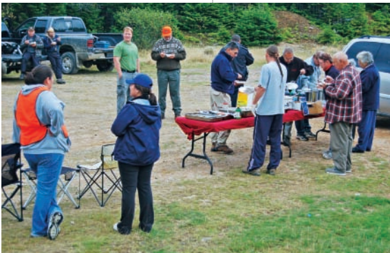
“Cook-out” on Hunter’s Mountain in Cape Breton Highlands National Park, attended by native and non-native hunters.

concerned about sustainability of the herd, and the potential for over-exploitation as a result of some activities that are inconsistent with Mi'kmaq culture and views about how collective