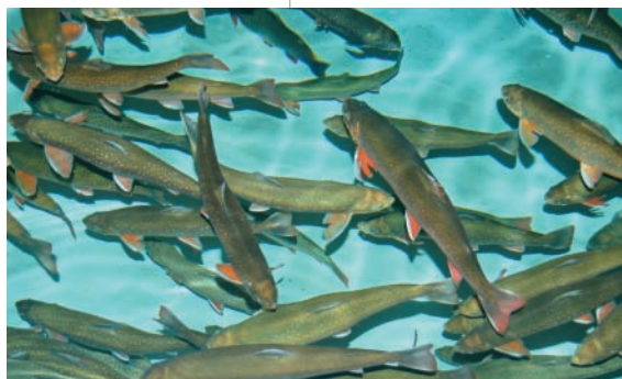
Arctic char at an aquaculture facility in Millbrook First Nation, viewed by the Mi'kmaq, Canada and Nova Scotia negotiation teams, during a site visit in February 2007.

with provincial and federal jurisdictions. At the same time, there are more immediate fisheries issues where the parties may seek resolution on an interim or incremental basis. The Fisheries Working Group is examining these questions. An important component of this work will be for each party to work with their respective communities and stakeholders.