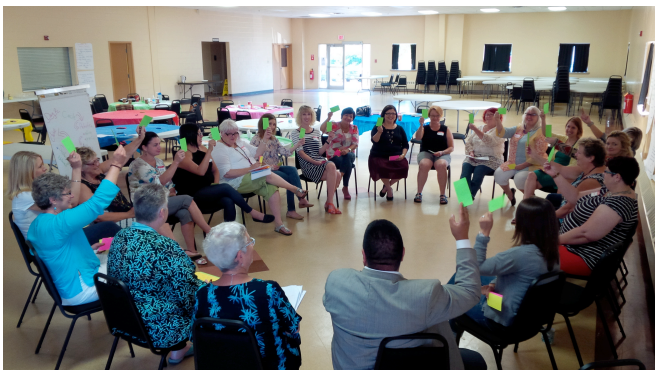
CSN workshop in Sydney Sept 17 & 18, 2015

The collectively-developed draft action plans support the key action areas of coordinated counselling and support, visibility, navigation, and safer spaces & non-judgmental services. These action areas developed out of what was heard from communities in the first year of the strategy.