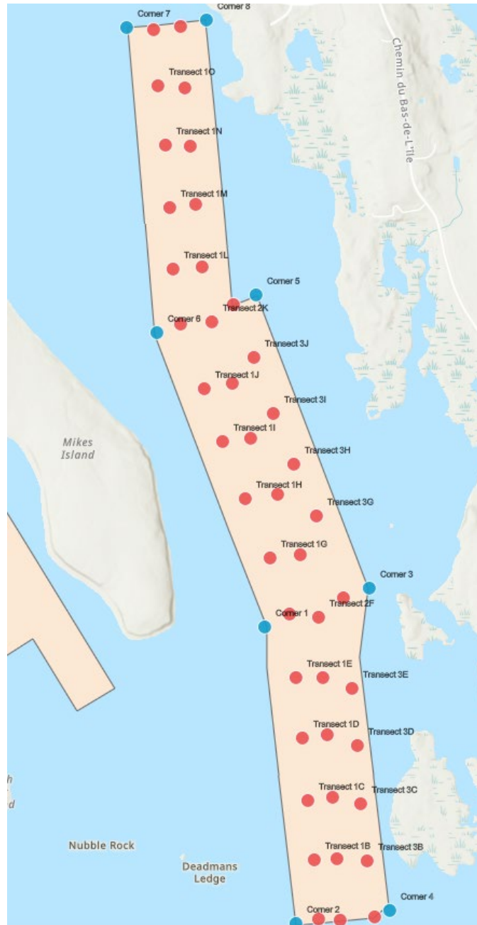
Figure 2. Map displaying baseline video sampling station locations