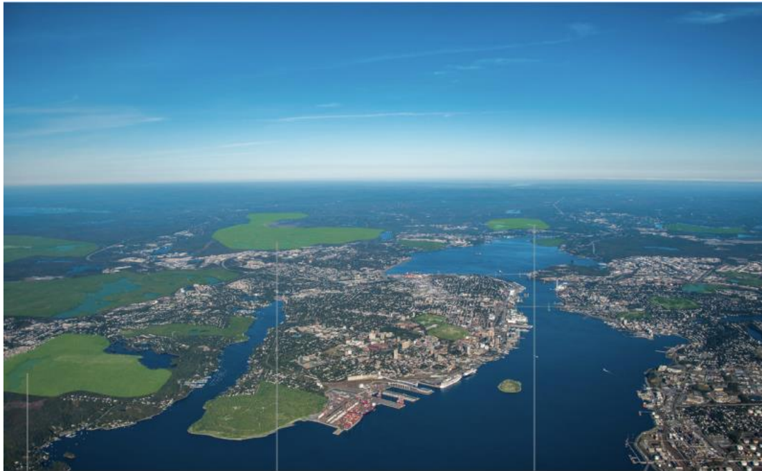
The Purcell's Cove Backlands.