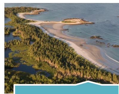
Coastal & Water