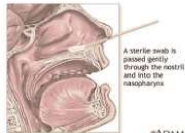
Image obtained from http://www.nlm.nih.gov/medlineplus/ency/imagepages/9687.htm