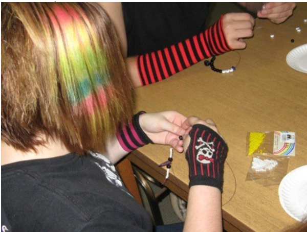
crafting @ the library...

Wolfville Memorial Library 21 Elm Ave. 542-5760