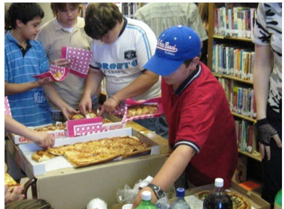
...and pizza @ the library!