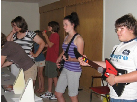
gaming at the library....

> your library newsletter about programs, events, books, and other interesting stuff for ages 12-18