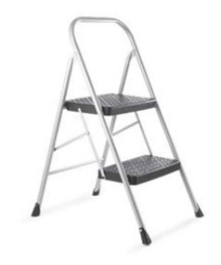
Typical Step stool / step ladder covered by CSA Standard definition

The OSGR's also require the use of Grade 1 or 2 Portable Ladders for devices that fall in scope. Grade 3 Ladders or devices noted as "Household Use Only" are not permitted to be used at workplaces.