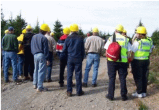
Photo: Participants at Eldon's WOYA field day witnessed a well managed woodland.

If you missed out this opportunity, it's time now to start planning for the WOYA celebration in your area, and book your seat on time!