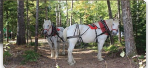
Two of the Uhlman’s majestic horses. All harvesting and maintenance work on the land is done with the aid of horses or oxen.