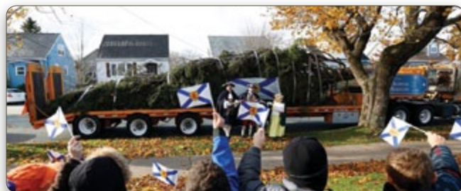
Every winter, Nova Scotia sends a real Christmas tree to the City of Boston to thank them for their kindness following the historic Halifax Explosion.

Submitted by the Christmas Tree Council of Nova Scotia