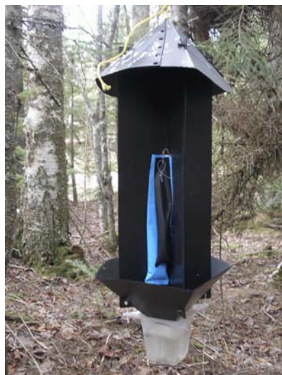
Figure 3. Baited BSLB trap.