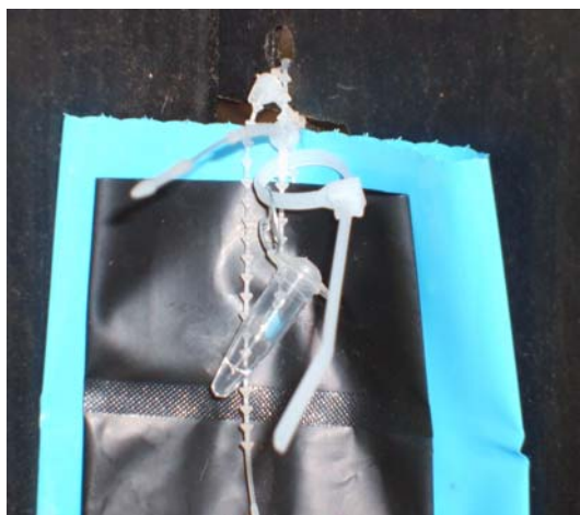
Figure 2. Pheromone hanging with 2 volatile lures.