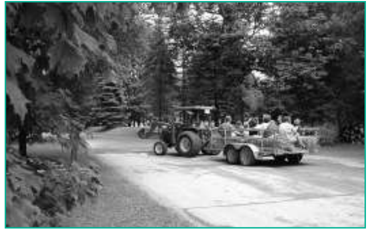
Family Fun Day is an annual Parks are for People event held at Smileys Provincial Park.