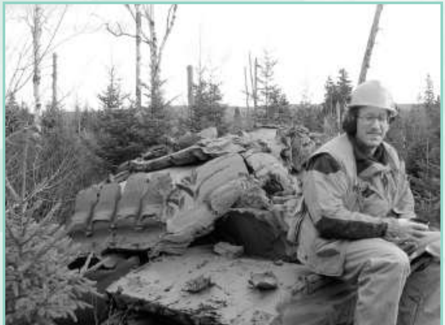
Close-up of massive, pure, plastic clay that characterizes these deposits.