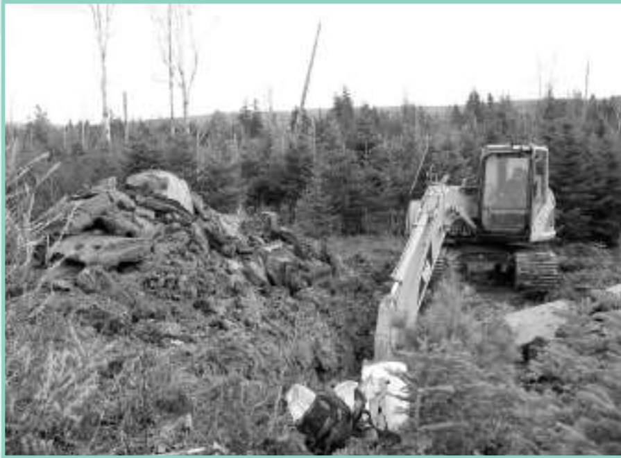
Excavating a clay deposit near River Denys (Eden). The CNR rail line to Sydney can be seen in the background.

Contaminant transport through a bottom liner can occur via “leakage”, diffusion, and dispersion. When the “leakage” is relatively slow (i.e. the clay is relatively impermeable), dispersion becomes negligible, and diffusion tends to dominate the contaminant transport process. This diffusive transport tends to be a very slow process compared to “leakage”, and hence the reason that relatively impermeable clay (i.e. a clay with low hydraulic conductivity) is used as a liner in many landfills.