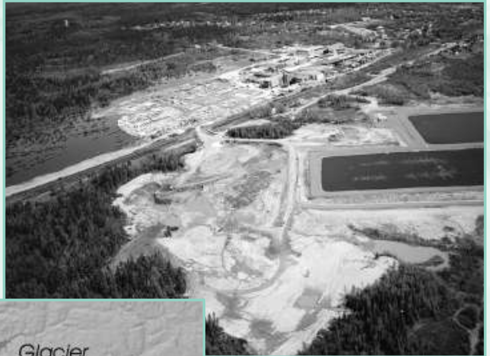
Lantz brickyard and clay quarry.

Shubenacadie-Grand Lake is an impressive lake today, but it is a mere shadow of its former self. At the end of the last ice age the remnants of kilometre-thick glaciers retreated out of the Bay of Fundy and Laurentian Channel leaving isolated ice caps over northern Nova Scotia. The melting glaciers acted as huge dams covering northern and western river outlets and forcing glacier meltwater to find alternative routes to the ocean.