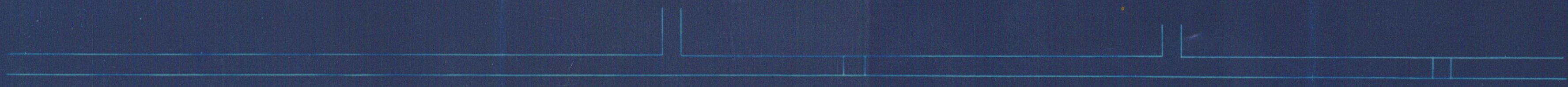
— Vertical Section — Fissure Vein —