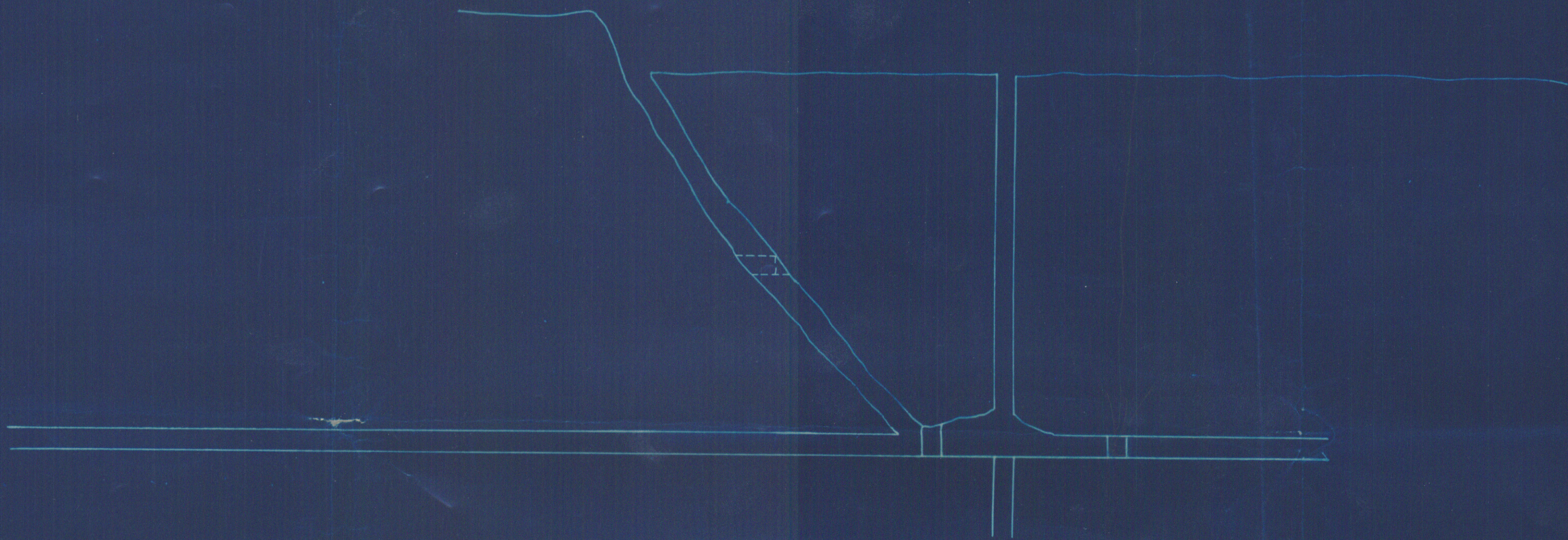
— Transverse Section — Looking East —