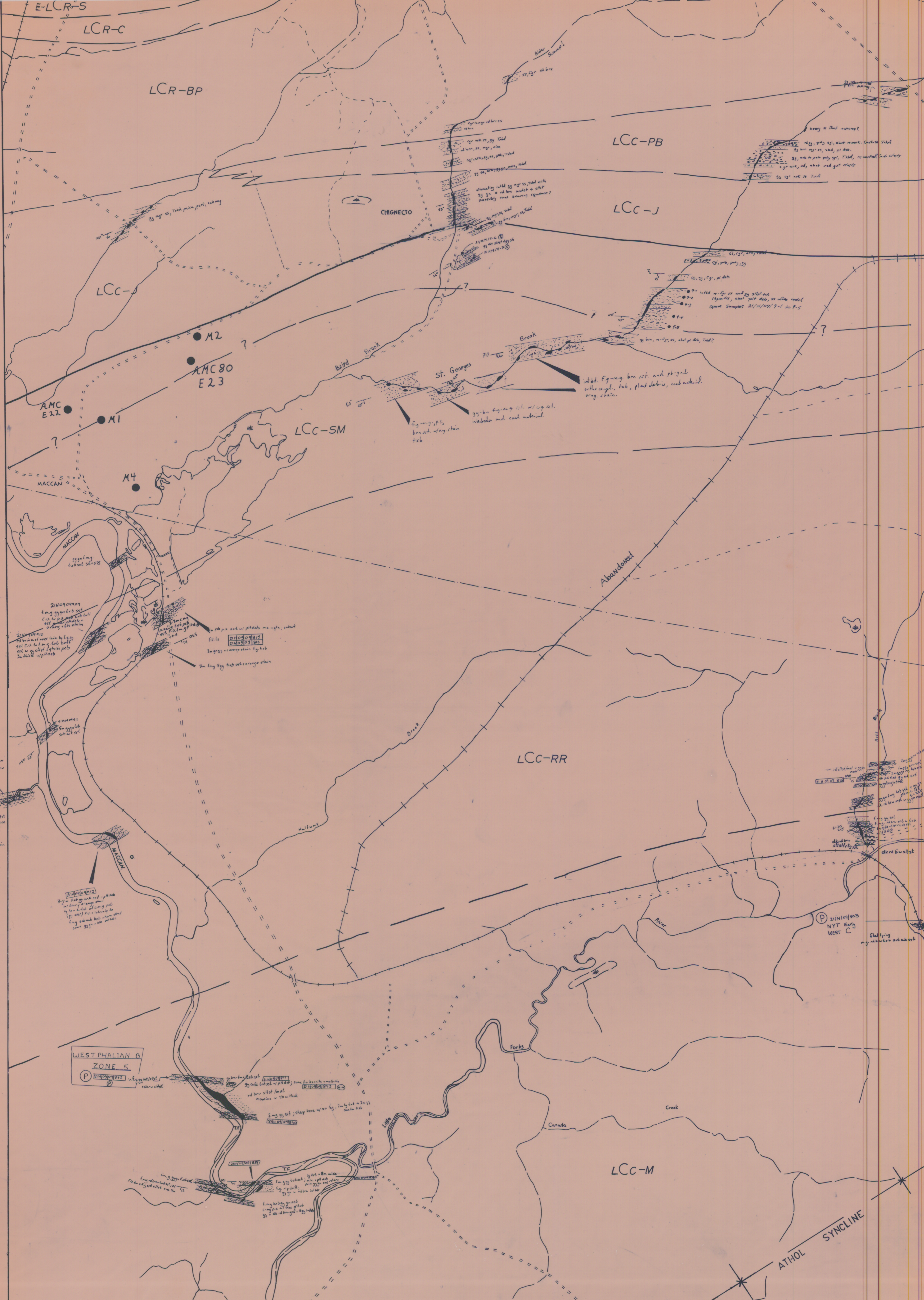
CUMB BASIN PROJECT MAP 21H/09/9