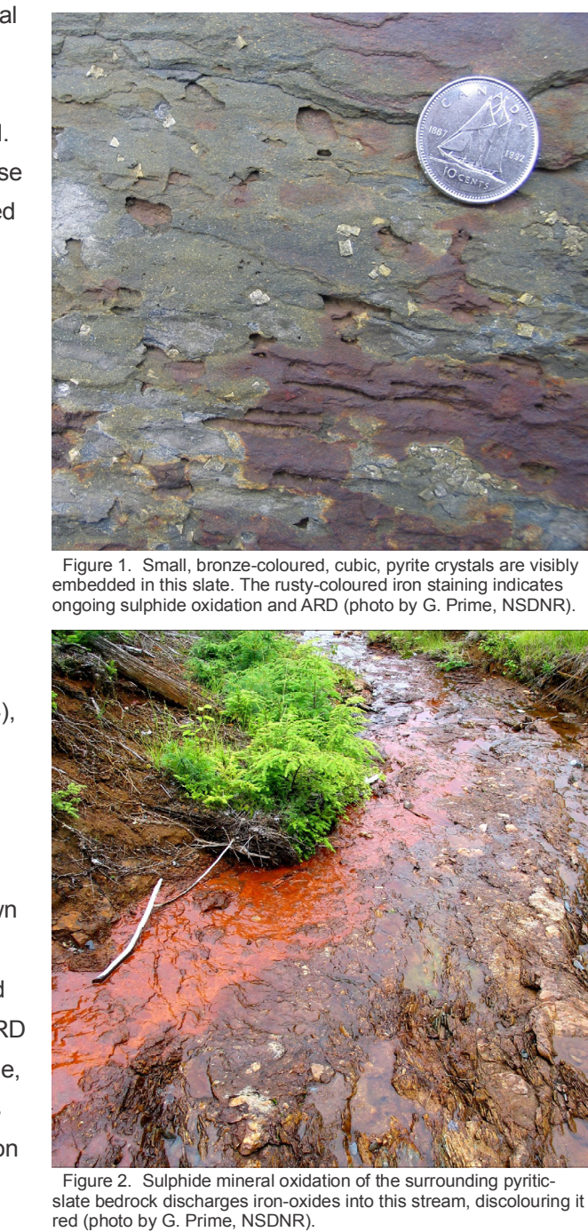
Figure 1. Small, bronze-colored, cubic, pyrite crystals are visibly embedded in this slate. The rusty-colored iron staining indicates ongoing sulphide oxidation and ARD.

Summary The intention of this map is to provide information about the geological hazard of ARD and its associated risks, and to identify where sulphide-bearing, potentially acid-generating bedrock is located in southwestern Nova Scotia. Physically disturbing and exposing sulphide-bearing rocks can accelerate ARD. Determining if sulphide-bearing bedrock is present should be to be considered during the planning stage of development and construction in order to avoid negative environmental and human health effects as well as to reduce costly remediation. The best way to prevent ARD is knowing where sulphide-bearing bedrock is located and to avoid disturbing and/or exposing it. Additional Information For more information about ARD, please refer to Information Circular ME 067. Additional information includes the factors that influence ARD, the human activities that initiate ARD, and the effects of ARD that impact human health, the environmental and infrastructure.