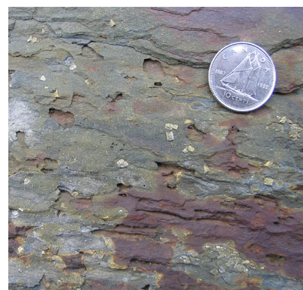
Figure 1. Small, bronze-coloured, cubic, pyrite crystals are visibly embedded in the slate. The rusty-coloured iron staining indicates ongoing sulphide oxidation and ARD.

Additional Information For more information about ARD, please refer to Information Circular ME 067. Additional information includes the factors that influence ARD, the human activities that initiate ARD, and the effects of ARD that impact human health, the environmental and infrastructure.