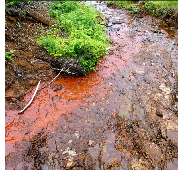
Figure 2. Sulphide mineral oxidation of the surrounding pyrite-bearing bedrock discharges iron oxides into the stream, discoloring it red.