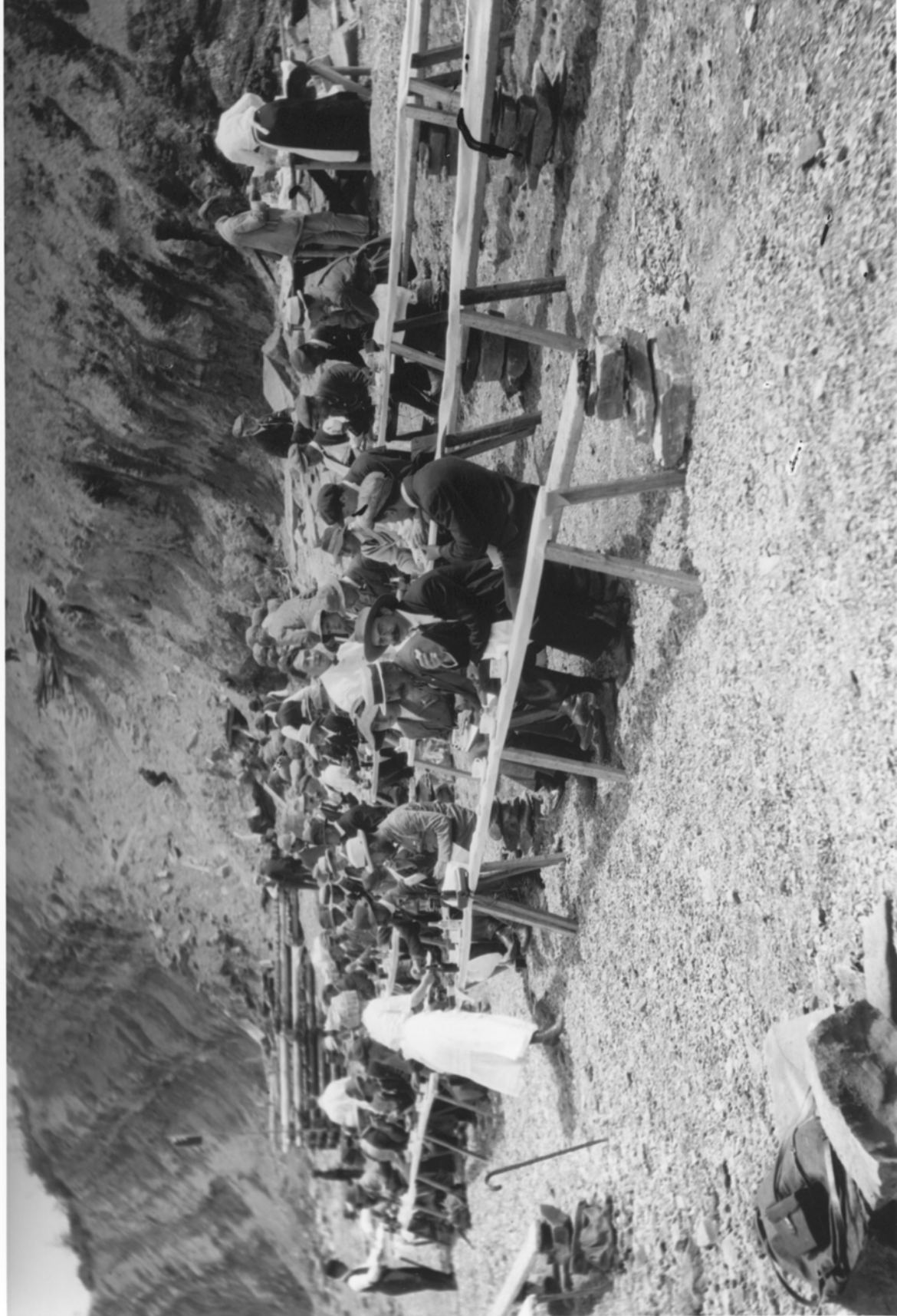
Figure 4. Delegates to the International Geological Congress of 1913 at lunch on their field trip to the coastal section at Jogjins. The locality of the photograph is in the vicinity of the Fundy Seam (GSC photograph 24289).