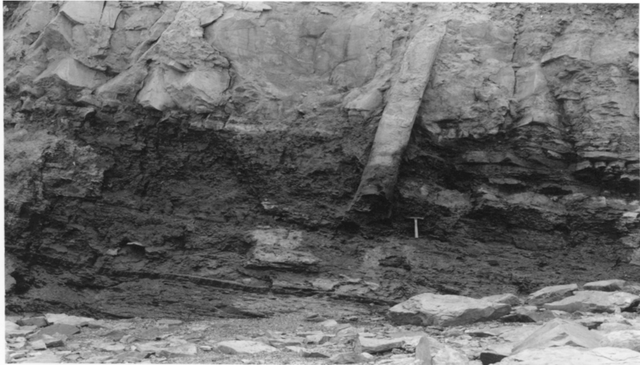
Figure 3. An erect fossil lycopsid tree of the Joggins Formation, entombed in growth position.

Ultimately, the case for scientific justification will be presented by Canada to the World Conservation Union (IUCN), the body designated by UNESCO to evaluate natural sites. A timeline for projects is currently being evaluated by the Scientific Subcommittee, but it is hoped that the bulk of the justification dossier will be in hand within two years. Although not explicit in the UNESCO and IUCN guidelines, it is clearly implied that sites that represent certain periods of Earth history are favoured, and time is of the essence if Joggins is to be the first, and possibly only, site considered for the Carboniferous 'Coal Age'.