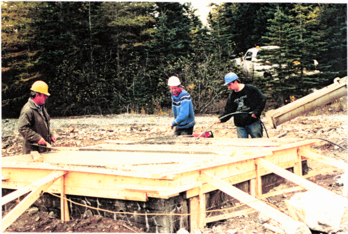
PHOTO NO. D-7: Finishing surface and vibrating concrete around rebar and forms.