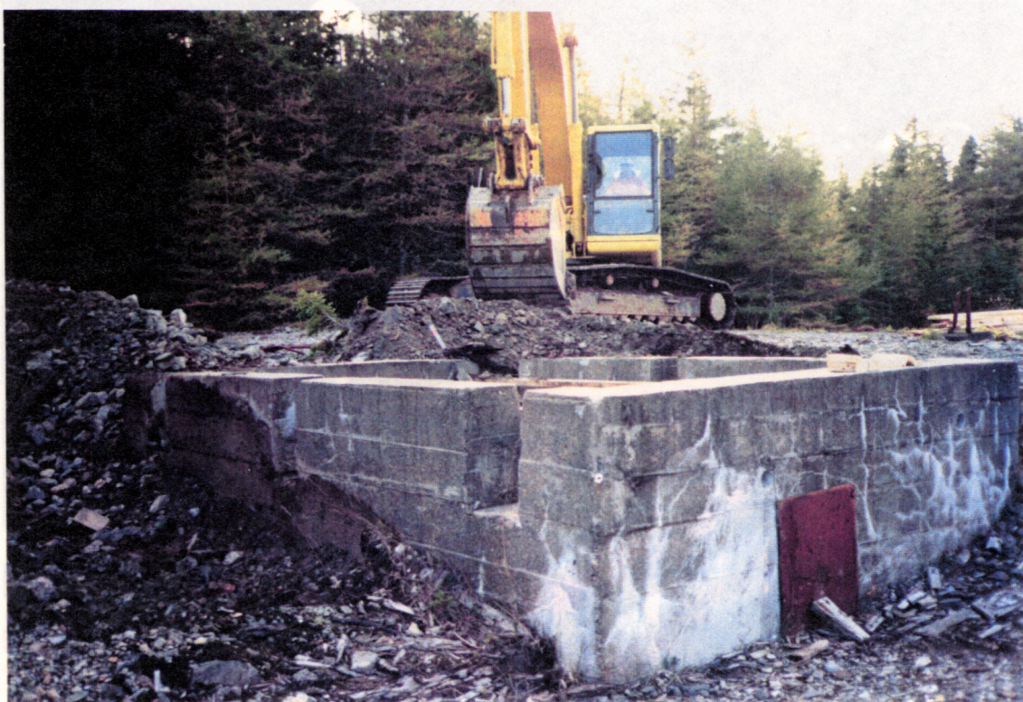
PHOTO NO. D-1: No. 1 Shaft collar showing shaft timber support notches.