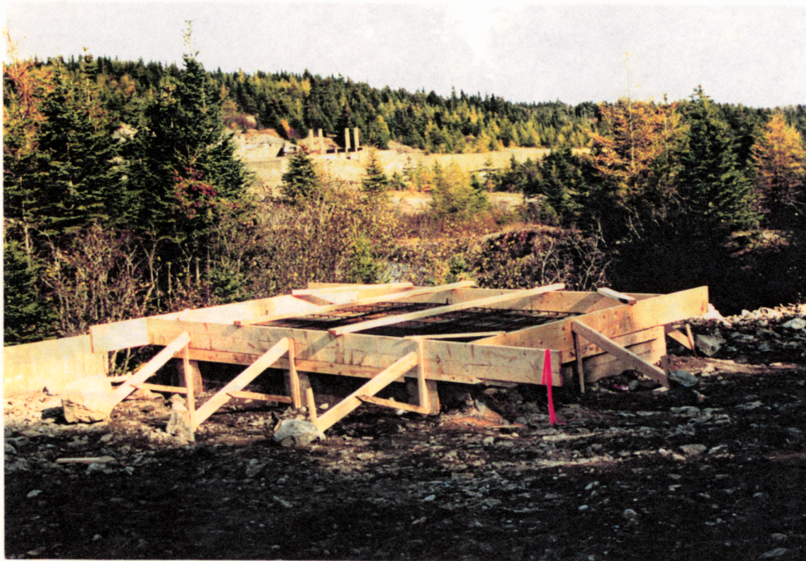
PHOTO NO. D-7: Finishing surface and vibrating concrete around rebar and forms.