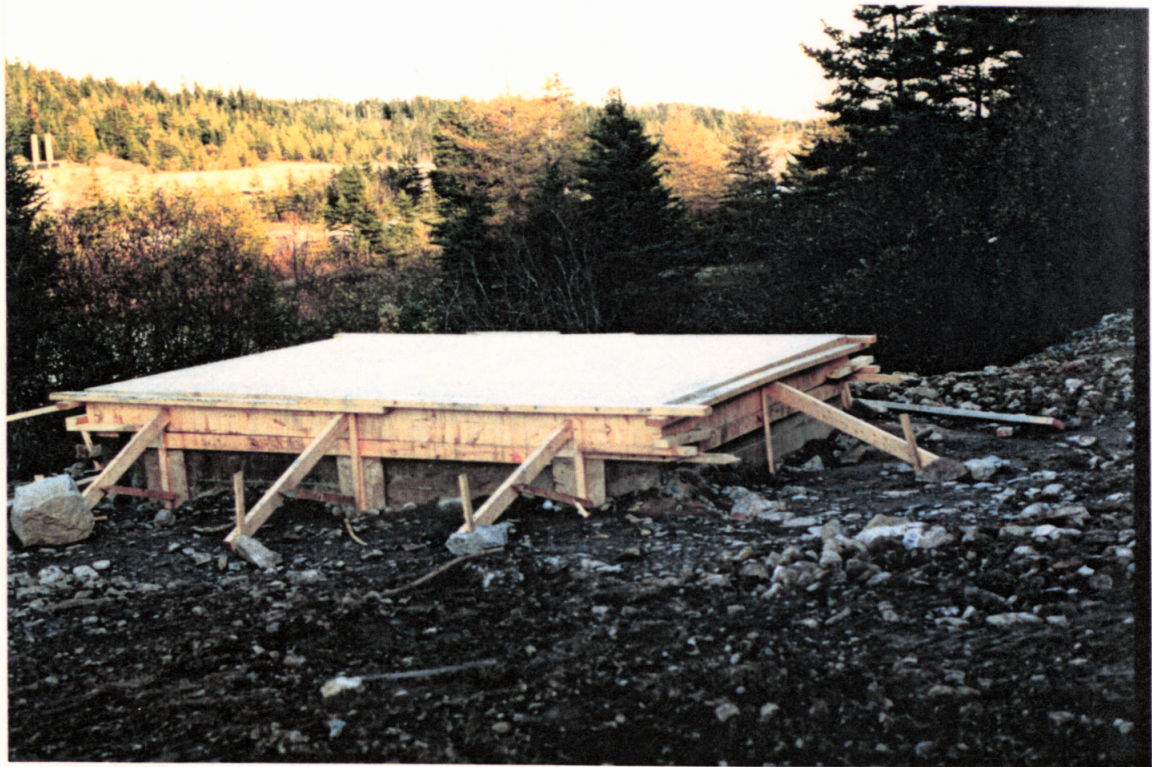
PHOTO NO. D-8: Concrete cast-in-place cap prior to removal of wooden forms.