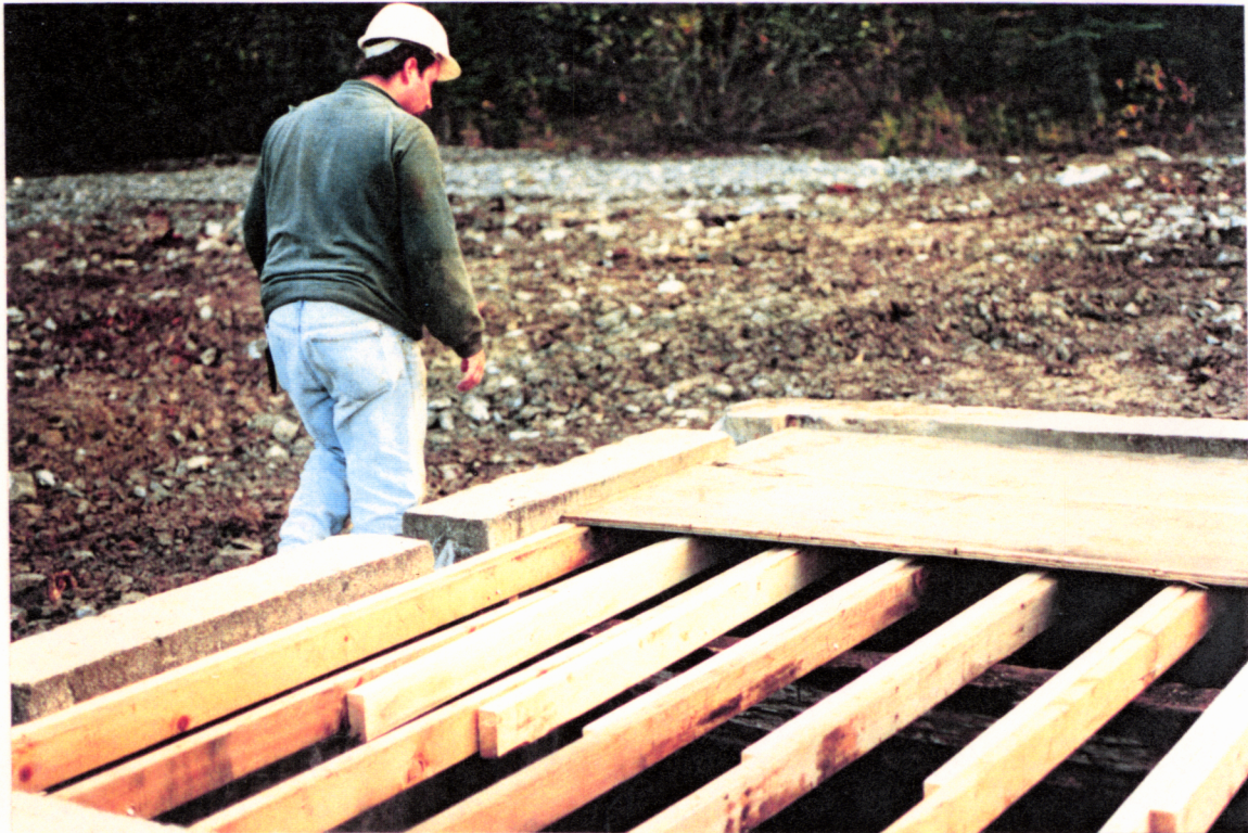
PHOTO NO. D-3: Positioning plywood cover on support formwork leaving 50 mm edge around concrete collar.