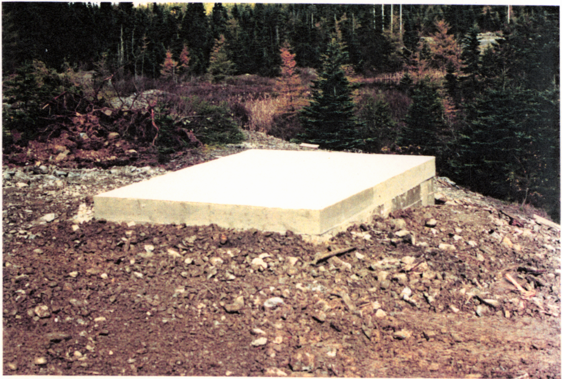
PHOTO NO. D-9: Completed cast-in-place concrete cap over No. 1 Shaft.