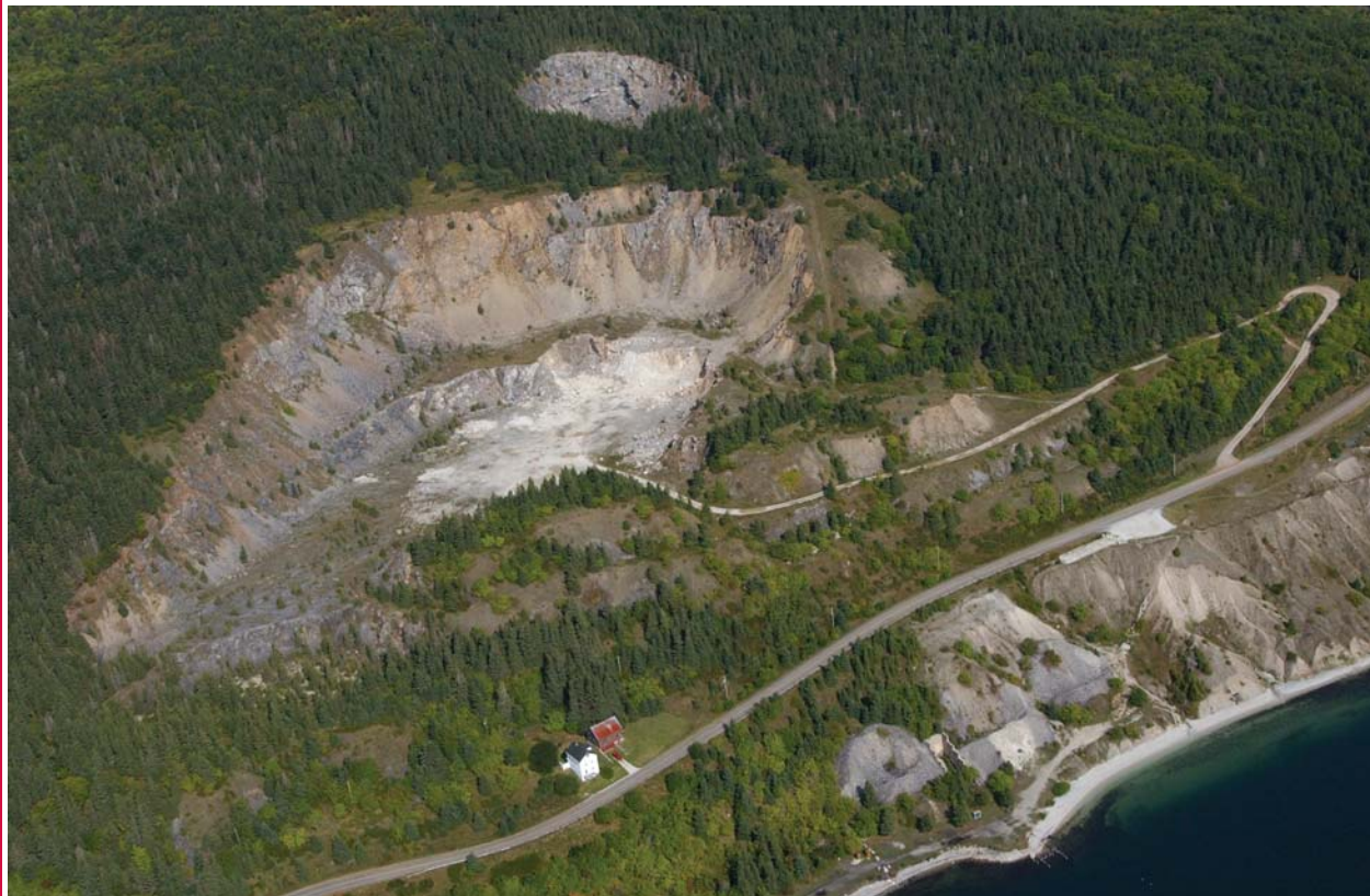
Marble Mountain limestone quarry