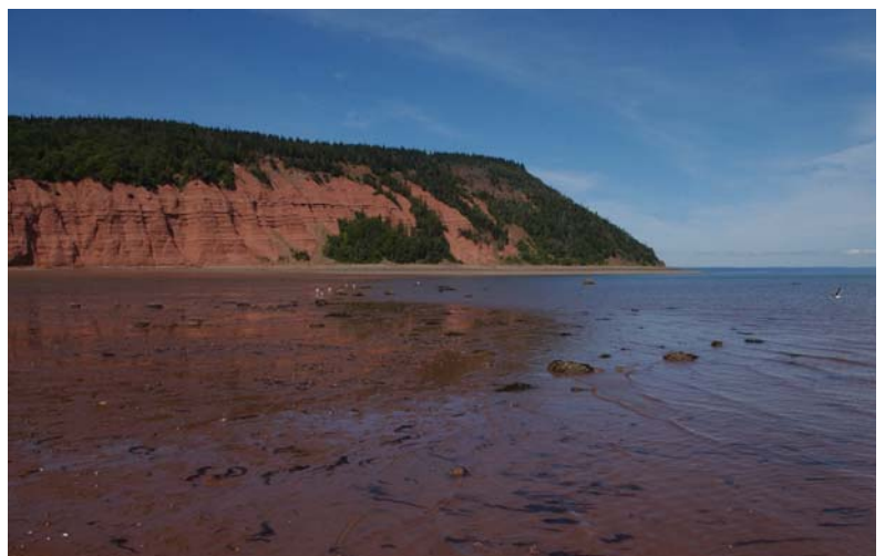
Photo shows the North Mountain at Cape Blomidon.