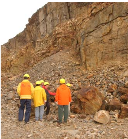
Last year's field trip included a stop at the former East Kemptville tin mine, where mineralized outcrop abounds.

The technical session on the morning of November 9 will focus on the gold potential of southern Nova Scotia. The session will be hosted by