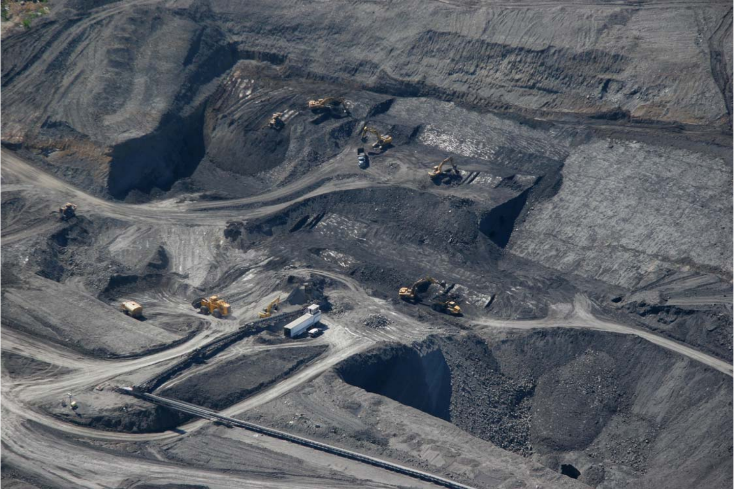
Aerial view of mining operations at the Pioneer Coal Limited mine in Stellarton, Pictou County. Nova Scotia is a mining province.

The technical session on the morning of November 9 will focus on the gold potential of southern Nova Scotia. The session will be hosted by