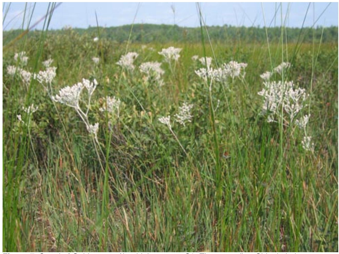
Figure 7. Stand of Goldencrest ( Lophiola aurea – S2, Threatened) at Shingle Lake, Lunenburg County.