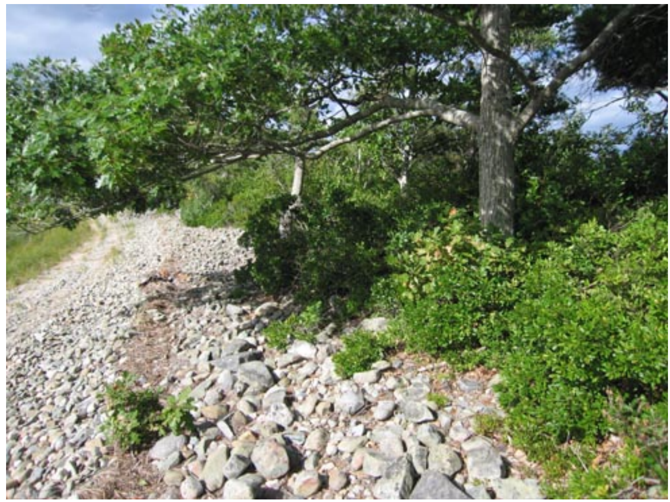
Figure 3. Habitat of Canada Frostweed ( Helianthemum canadense - S1, provincially Endangered) in the transition zone between upper beach and shrubby, open red oak – white pine forest, Ponhook Lake.