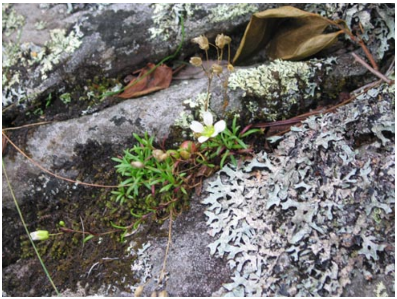
Figure 8. Greenland Sandwort ( Minuartia groenlandica – S2, Sensitive), found on lakeshore rock outcrop at Seven Mile Lake, Lunenburg County.