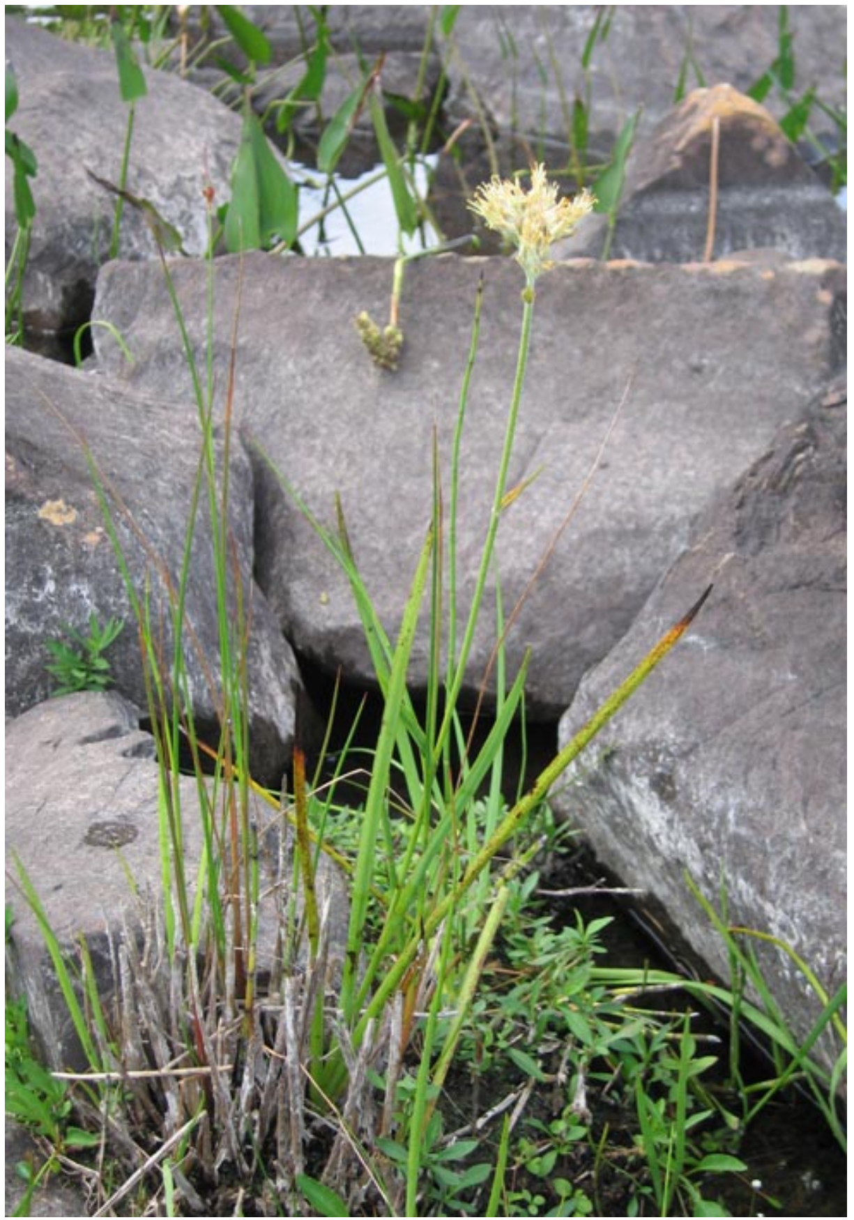
Figure 4. Redroot ( Lachnanthes caroliniana - S1, Threatened) in flower at Molega Lake near The Narrows.