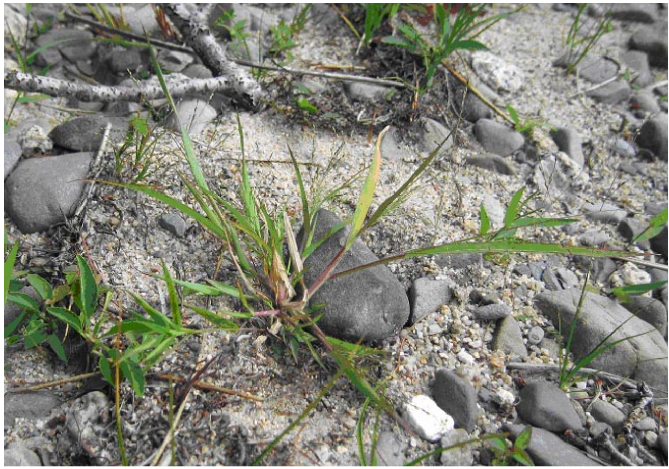
Figure 10. Philadelphia Panic Grass ( Panicum philadelphicum , = P. tuckermanii – S2S3SE, Sensitive), found on sandy beach at Ponhook Lake, Queens County. The occurrence of this species in relatively remote, unaltered sites such as this one strongly suggests that it is native to Nova Scotia but previously overlooked.