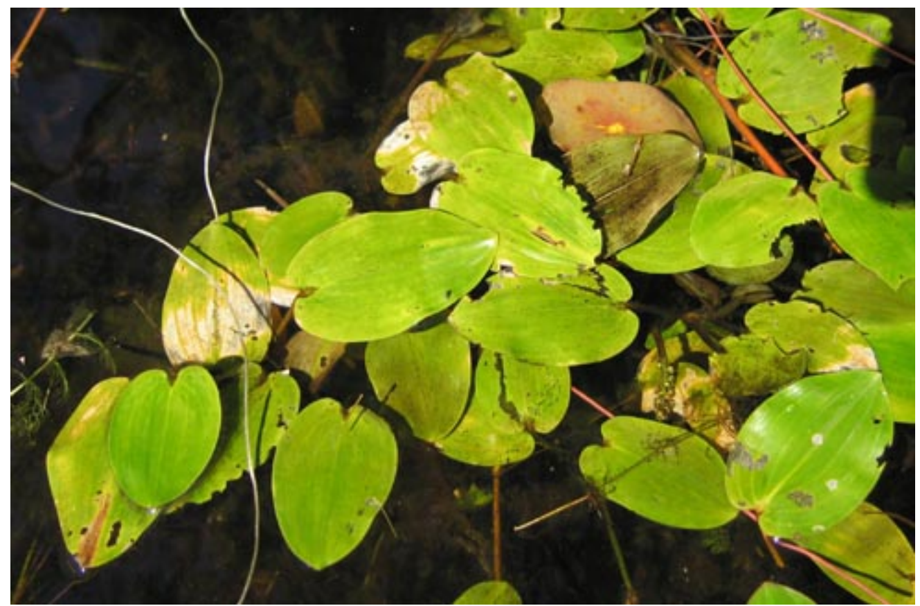
Figure 5. Spotted Pondweed ( Potamogeton pulcher - S1, May Be At Risk), found at Hirtle Lake, Lunenburg County. Note the cordate (heart-shaped) base of the broad floating leaves. The project's two records of this species were the first well documented records in Canada since 1958.