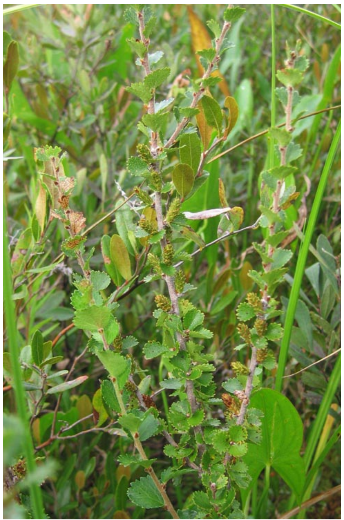
Figure 6. Michaux's Dwarf Birch ( Betula michauxii – S2, Sensitive), in a lakeshore fen at Long Lake, Lunenburg County. This was the second inland record for the species in Nova Scotia.