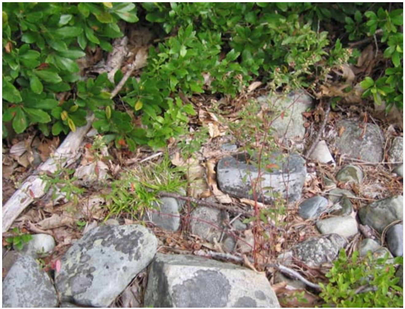
Figure 2. Canada Frostweed ( Helianthemum canadense - S1, provincially Endangered), found on upper lakeshore at Ponhook Lake.