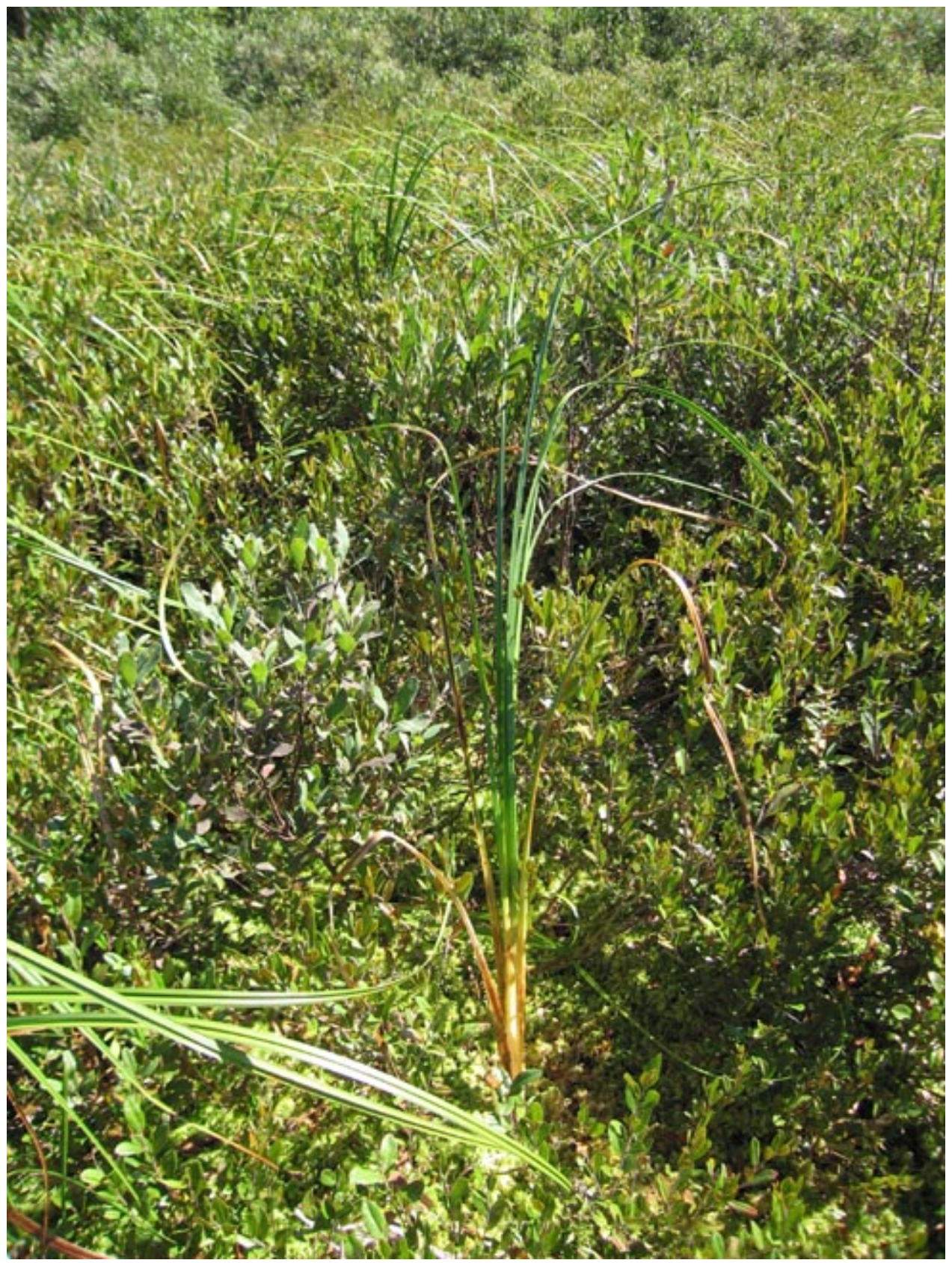
Figure 9. Stand of Long's Bulrush ( Scirpus longii – S2, Special Concern), found in shrub fen at Russell Lake, Queens County. The large plant in the centre of the picture was collected for a specimen and placed in the picture to illustrate the species' large size.