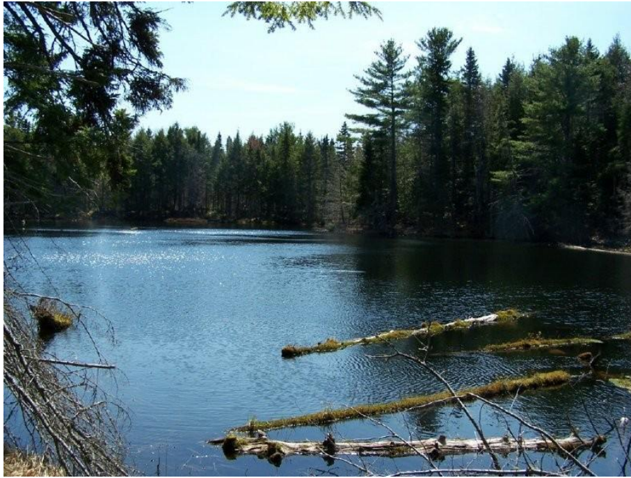
DeWolfe 'Lake' – A small pond ecosystem found on the property.