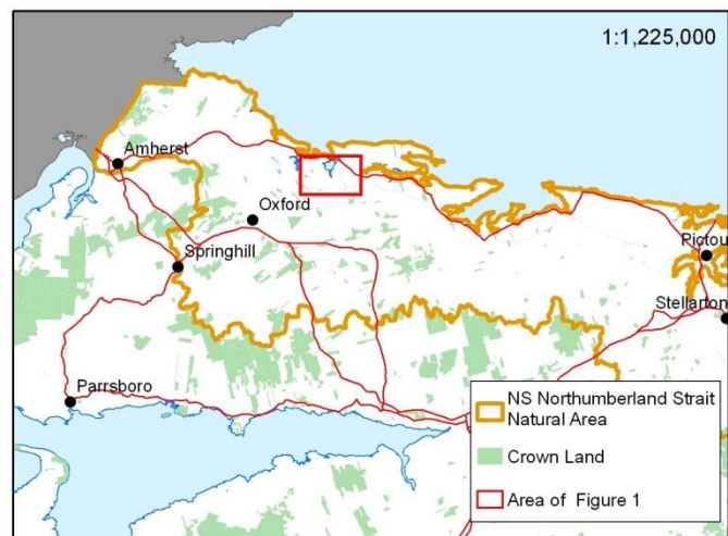
Figure 2: Location of the Pugwash - Wallace Bay Focal Area

Projection: UTM, Zone 20, meter (North American Datum 1983)