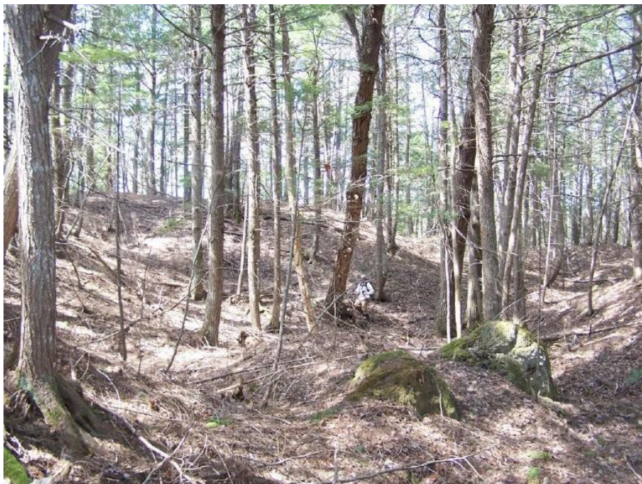
Undulating forest floor composed of gypsum with mature hemlock canopy above.