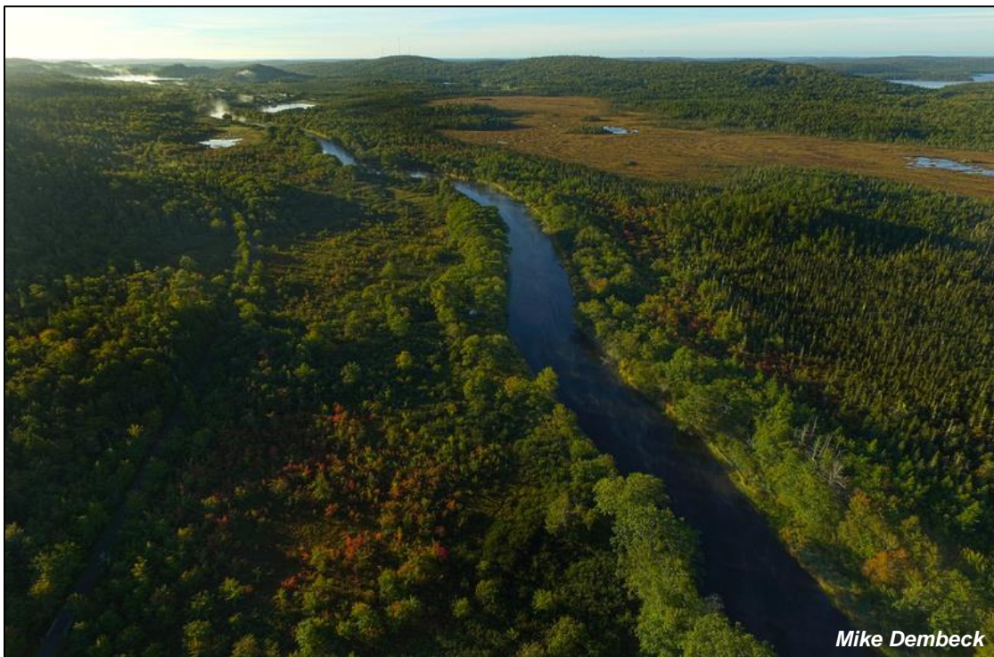
Lower Musquodoboit River, focus on ongoing land assembly by Nature Conservancy of Canada