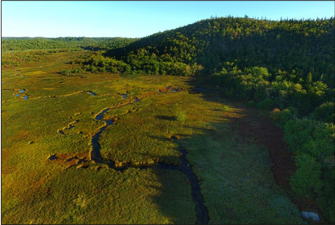
Kelly's Meadow, Lower Musquodoboit River including lands protected by Nature Conservancy of Canada