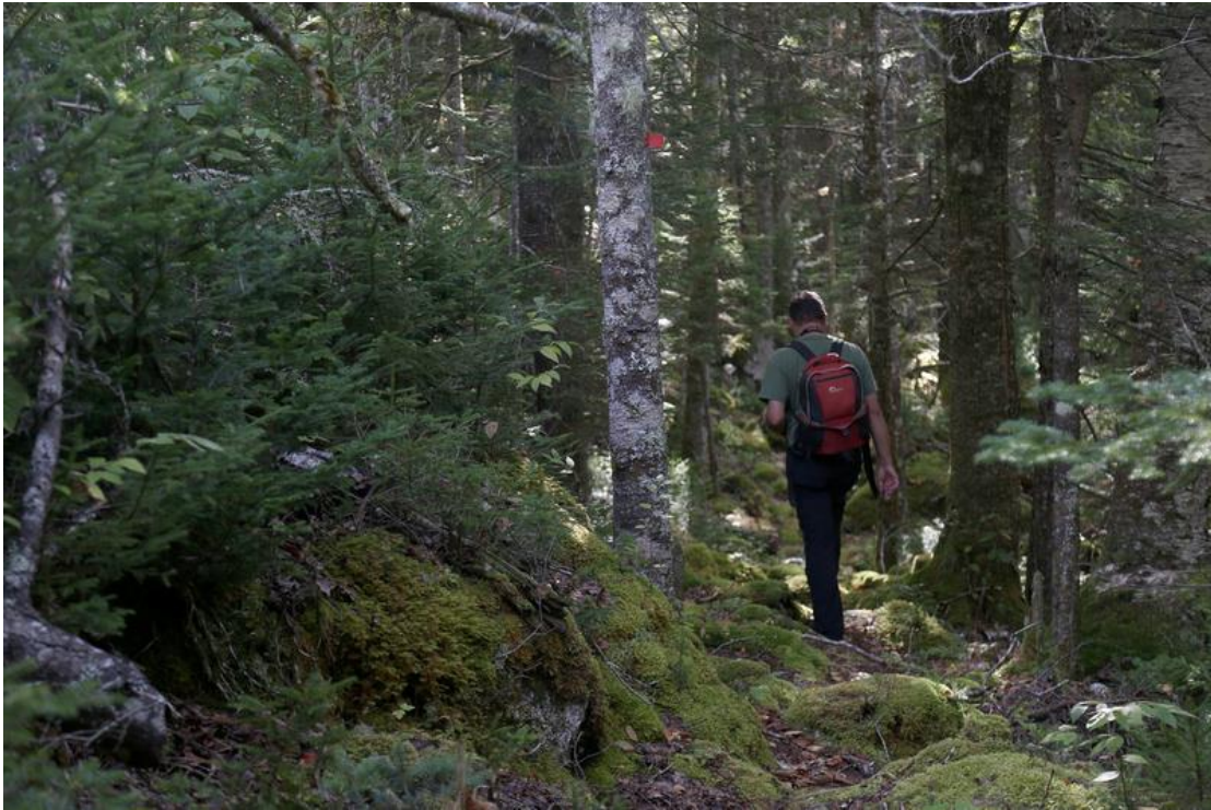
Hiking the backcountry trails in the Lower Musquodoboit River Valley