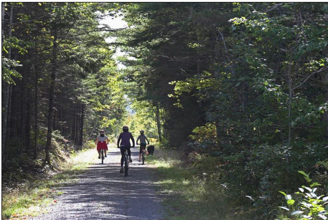
The Musquodoboit Trailway, managed by the Musquodoboit Trailways Association runs parallel to the river and offers excellent access and scenic vistas of the Lower Musquodoboit