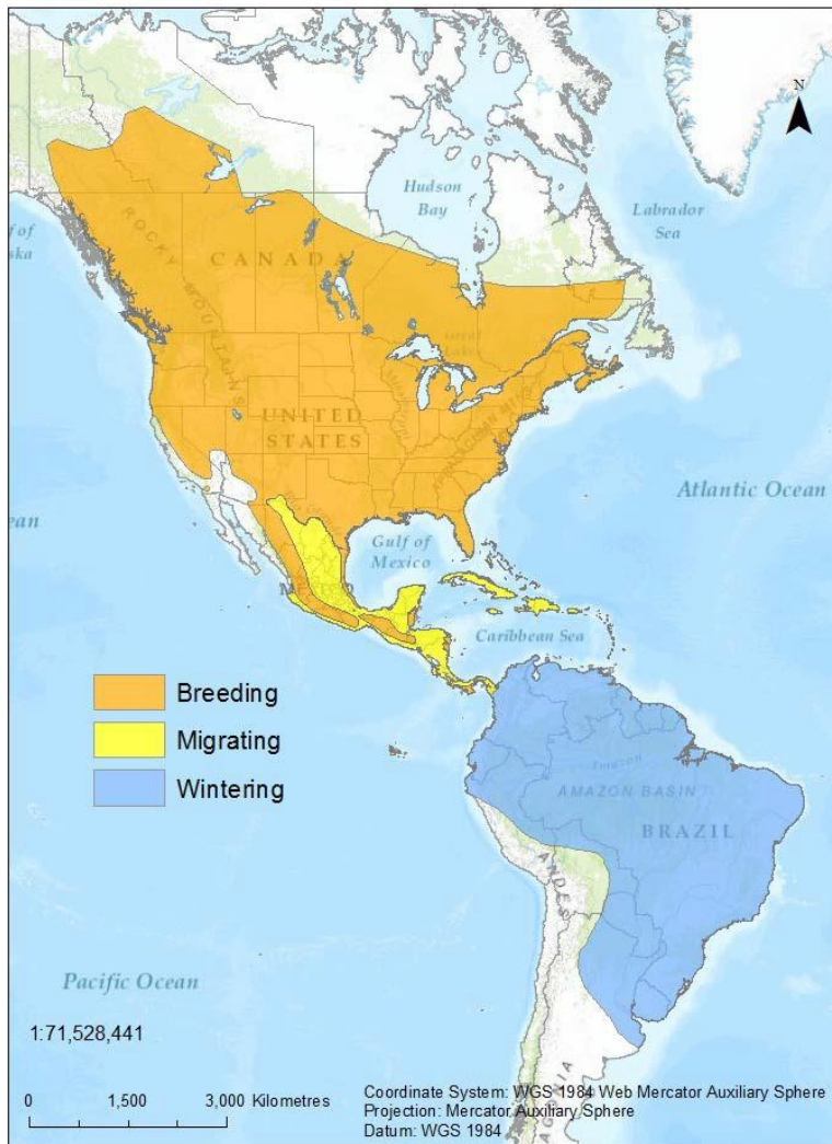
Figure 1. Common Nighthawk distribution map (adapted from BirdLife International and NatureServe (2014), using data from Haché et al. (2014), and eBird (2014)).

Ten percent of the global population of Common Nighthawks is estimated to breed in Canada (Rich et al. 2004) and the species' population in Canada, based on Breeding Bird Survey results, was estimated in COSEWIC (2007) as 400,000 adults and underwent an 80% decline between 1968 and 2005 (average: -4.2% per year; Downes et al. 2005). More recently, the Partners in Flight Population Estimates database was updated and now provides the most comprehensive information on North American landbirds. The Canadian population of Common Nighthawks is now estimated to be 900,000 adults (Partners in Flight Science Committee 2013). This does not represent an actual increase in the population but rather is the result of newer analytical techniques and a refined detection distance used to estimate density.