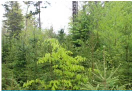
Successful regeneration on the Melanson woodlot.

Come explore the Melansons' woodlot on Saturday September 12 th , 2015 to learn about their excellent woodlot management practices.