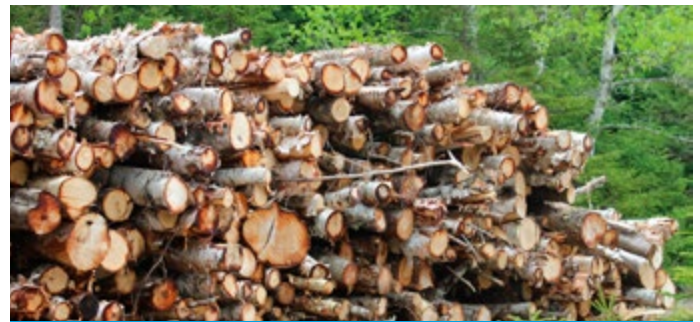
Stack of Birch and Maple trees from a recent patch cut.