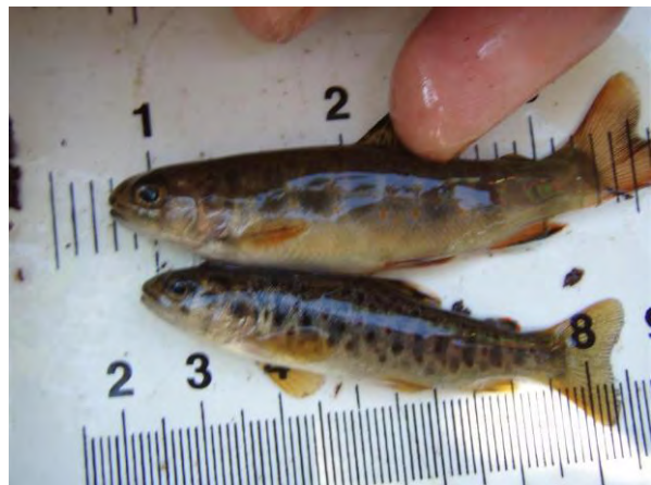
Photo 12: Watercourse WC-7 (top: brook trout, bottom: brown trout)