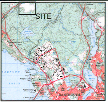
-KEY PLAN- N.T.S.