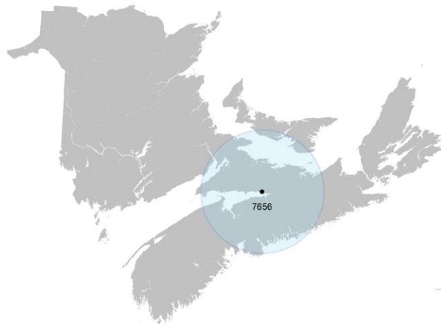
Map 1. A 100 km buffer around the study area