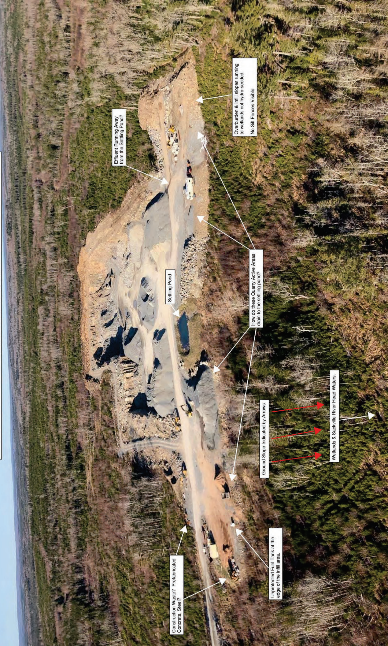
Mount Uniacke, NS - NCCI Quarry - Apparent Violations Identified by the Community Photo Taken: 3-May-2022

Effluent Running Away from the Settling Pond?