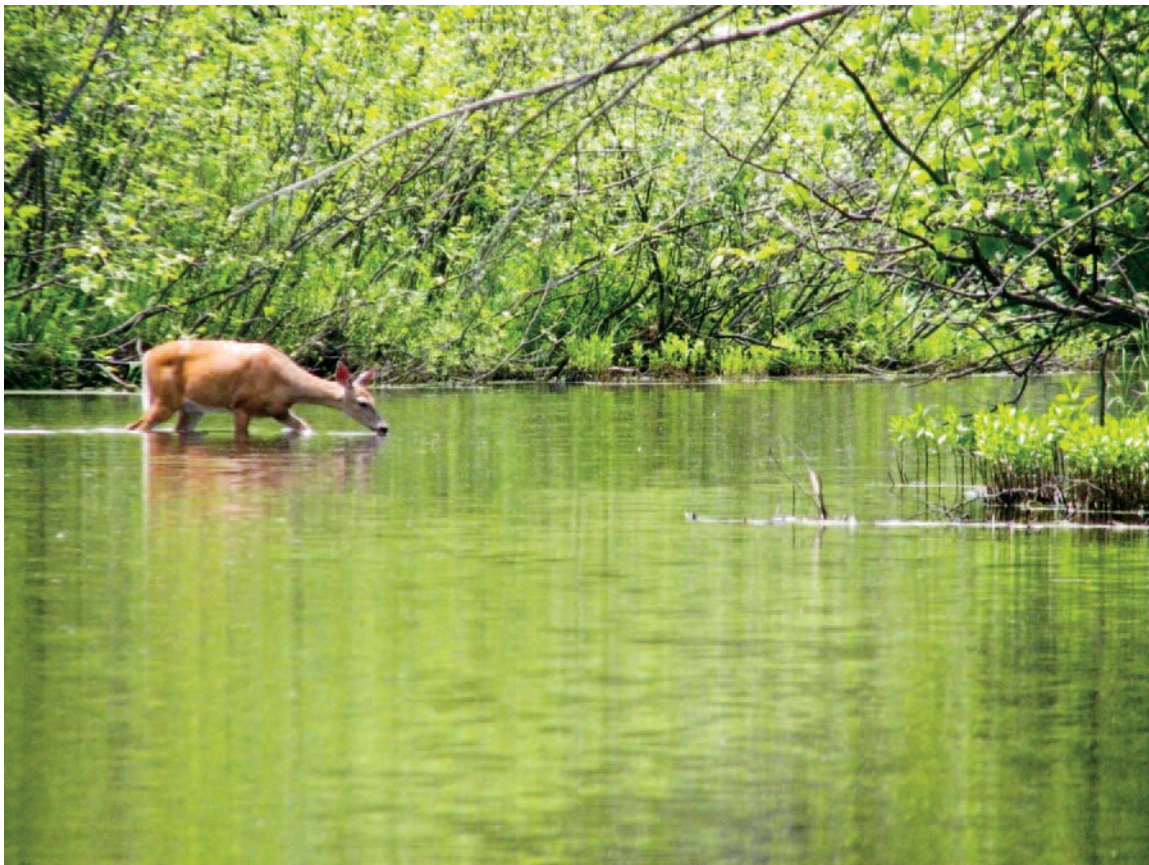
White-tailed deer drinking near a riparian shrub swamp

In the future, we plan to continually evaluate wetland conservation tools and practices from other provincial, federal and U.S. state jurisdictions and to adopt or adapt those deemed most efficient and effective for Nova Scotia. When feasible and effective for Nova Scotia, we will align wetland conservation tools and practices to increase consistency and clarity in wetland management throughout the Maritime provinces and across Canada.