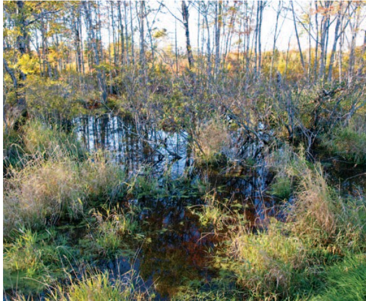
Pictou area vernal pool

these are small (typically less than 0.5 ha), shallow wetlands that lack permanent inlet or outlet streams and often dry out in the summer. They provide critical breeding habitat for frogs, salamanders, insects and fairy shrimp and feeding and drinking sites for birds, mammals, turtles and other wildlife.