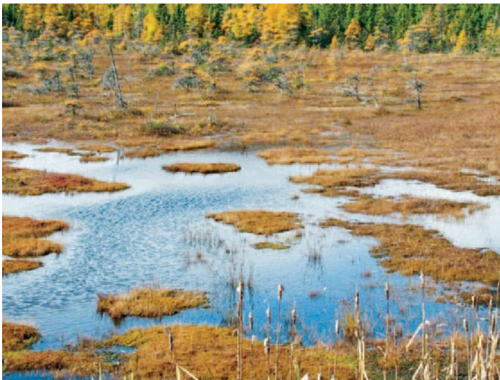
Cape Breton Bog