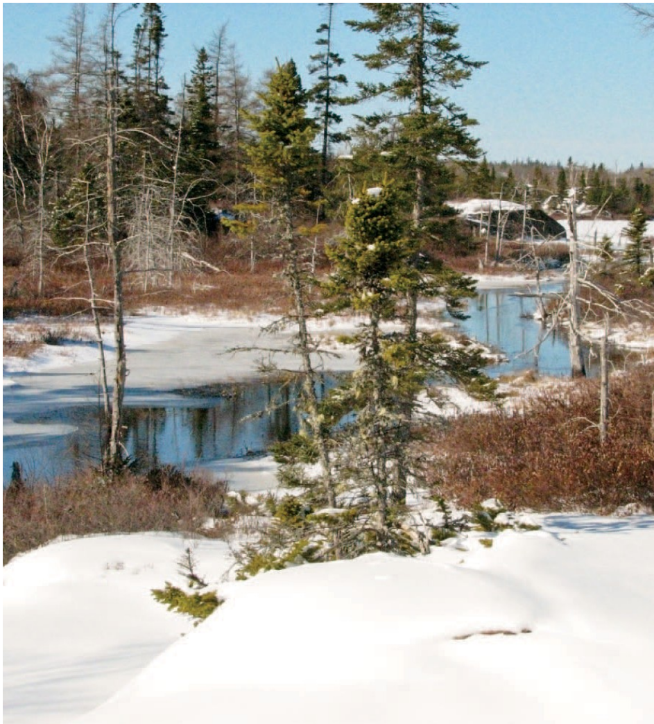
Riparian fen-swamp complex in the Blue Mountain–Birch Cove Lakes Wilderness