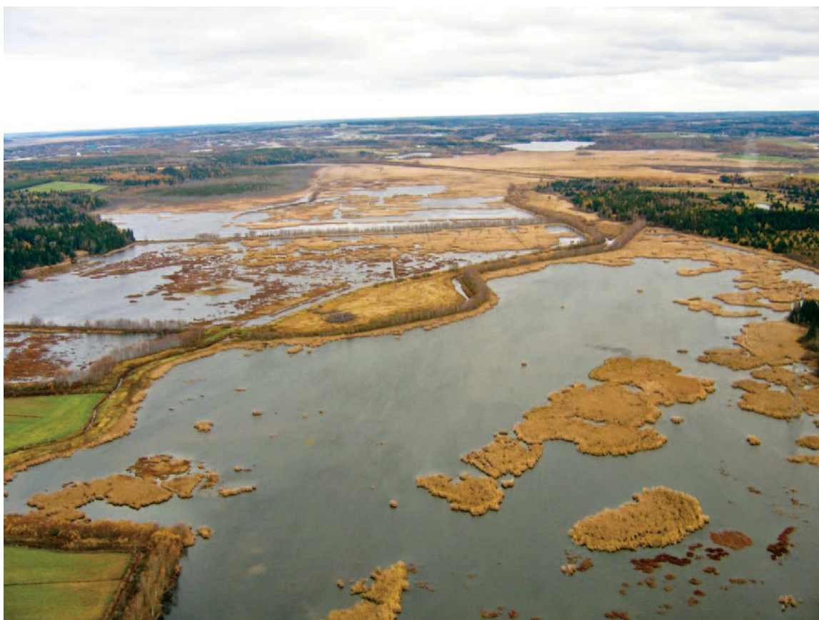
Chignecto National Wildlife Area near Amherst Point