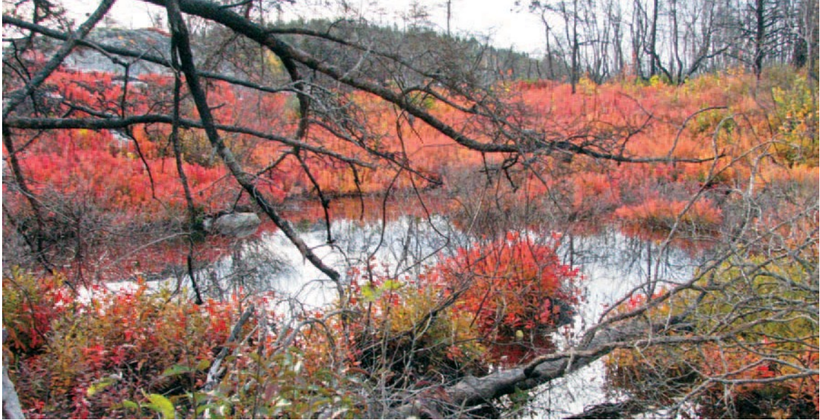
Late fall vernal pool near Herring Cove

Natural events, such as storms, that affect the flow of water can lead to wetland formation over the course of several years. It is the responsibility of all landowners to be aware of this potential and manage their land appropriately based on their intended future use. For example, if property owners identify a drainage problem caused by a storm on land that they intend to develop, they may wish to address standing water to avoid conditions that might create a wetland over time.