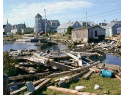
Hurricane Juan damage in Prospect, NS

levels in Atlantic Canada will rise at least 1 m over the next century. Higher water levels are expected to result in eroding shorelines, increased flooding during storms and high tides, damage to wharves, buildings and roads and contamination of drinking water supplies with salt water. Coastal development and rising seas have already degraded salt marshes and other coastal wetlands, leaving coastlines more vulnerable to large storms.