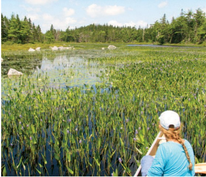
Tangier Grand Lake Marsh

Each type of wetland has a unique set of ecological conditions. However, wetlands can be characterized generally as habitats that have water at or near the surface (<2 m deep), little or no current (water flow), plants and animals that thrive in wet conditions and peat or rich mineral soils that develop where water saturates or floods the surface at least seasonally.