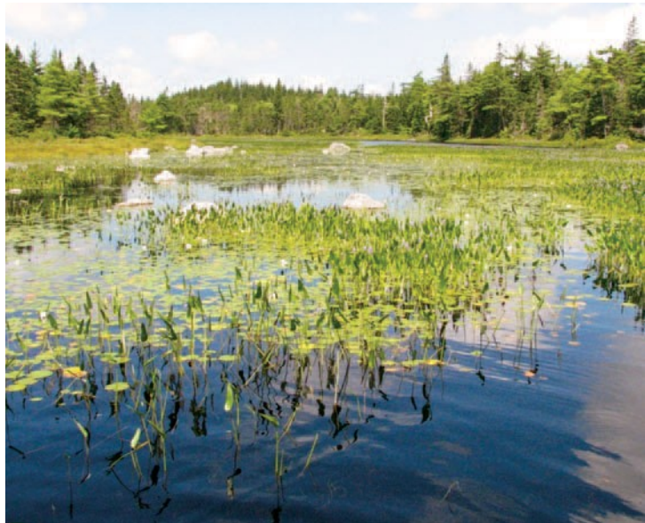
Emergent lacustrine marsh

a shallow-water wetland with water levels that fluctuate daily, seasonally or annually, occasionally drying up or exposing sediments. Marshes receive their water from the surrounding watershed as surface runoff, stream inflow, precipitation and groundwater discharge, as well as from longshore