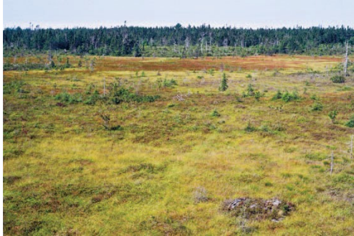
Shelburne area bog

As natural processes raise the bog surface, the water table in the bog rises relative to the elevation of the water table at the edges of the bog. Precipitation, fog and snowmelt are the primary water sources. Bog waters are low in dissolved minerals and acidic (usually between pH 4.0 and 4.8).