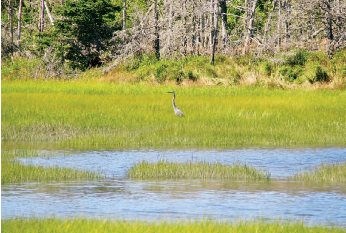
Great blue heron fishing in a salt marsh at Martinique Beach