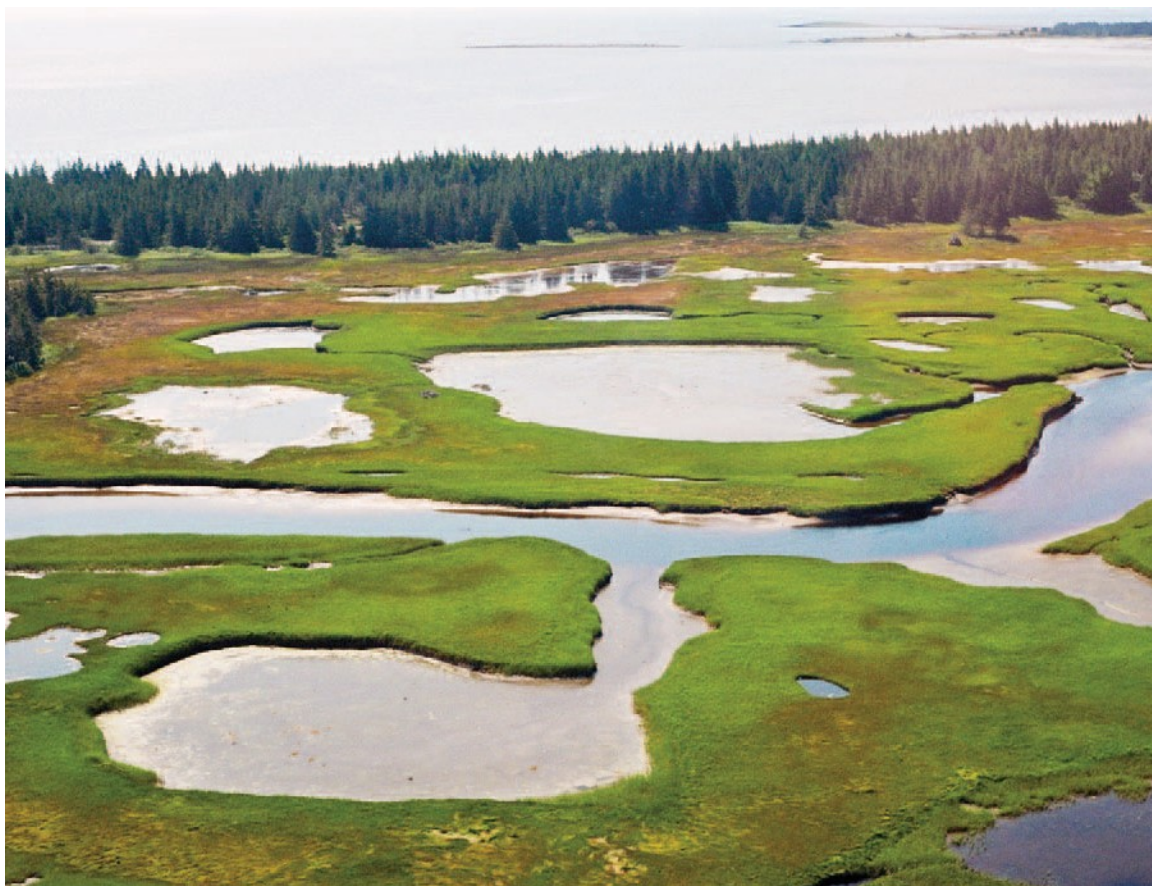
Salt marsh complex in Shelburne County