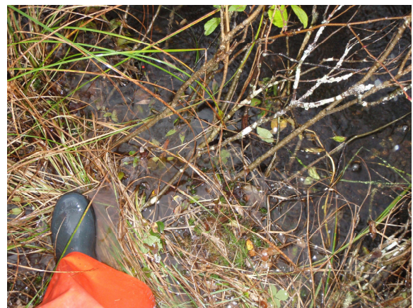
Photo 6: Furthest upstream section of assessment area; stream narrows considerably in wetland.