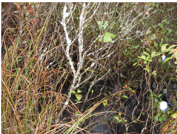
Photo 5: Furthest upstream section of assessment area ; stream narrows considerably in wetland