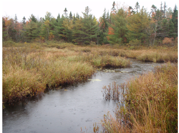
Photo 4: Upstream section of assessment area looking downstream towards mixed forest riparian zone