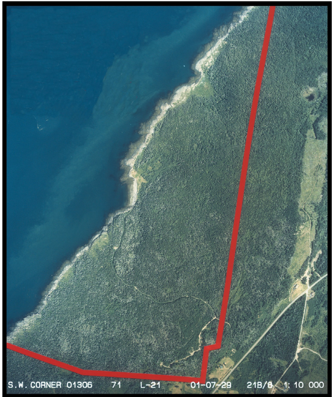
Figure 1. The Whites Point quarry property (2001 aerial photograph).