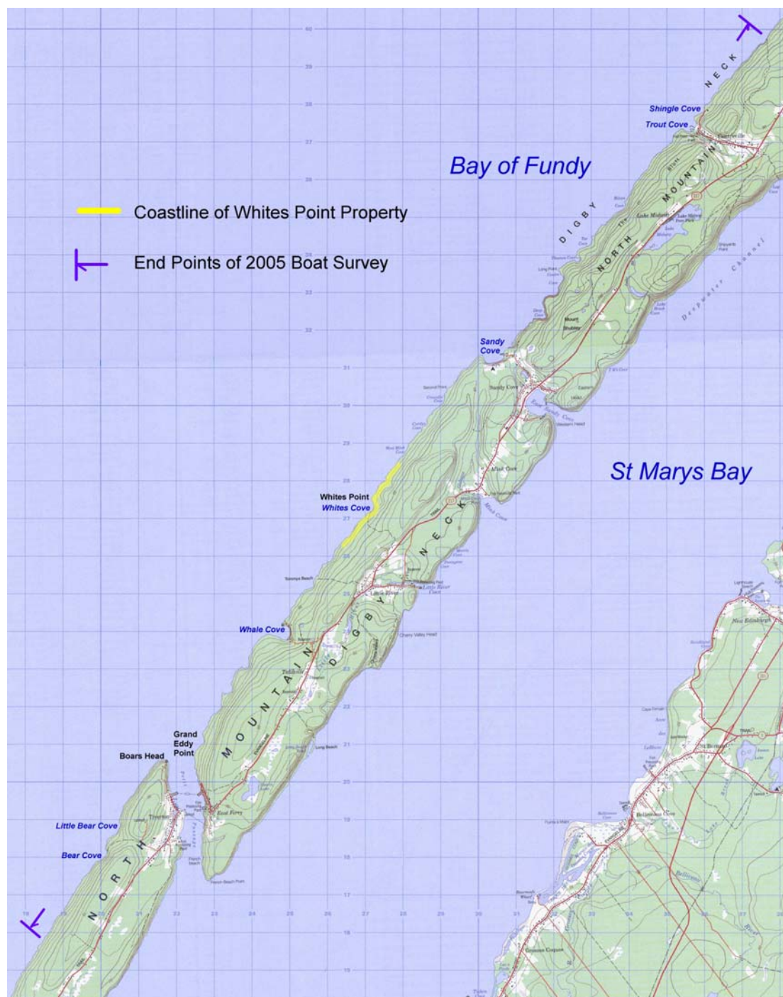
Figure 3. Coastline of Long Island and Digby Neck censused during the CWS boat survey for Harlequin Ducks, 9 February 2005.