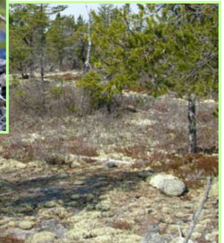
Jack Pine Barren