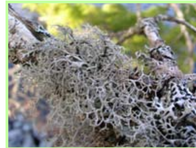
Pseudevernia cladonia - Ghost Antler Lichen

Keep It Wild Nova Scotia's Protected Areas