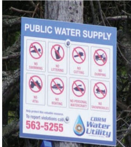
Kilkenny Lake Sign Posting

To “keep it clean” all water treatment facility approvals in Nova Scotia now contain a condition requiring a Source Water Protection Plan for the drinking water source. To help develop this plan Cape Breton Regional Municipality held the first meeting of the New Waterford Source Water Protection Committee in July 2008. The committee is a diverse group of stakeholders including: private