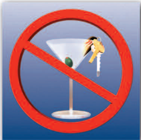
Don't Drink and Drive Symbol

Drinking and driving is a high-risk behaviour that can have serious consequences for you, your passengers, and other motorists or pedestrians. Alcohol is absorbed directly into the blood stream. This means that alcohol-induced impairment begins with the first drink. Legal impairment is defined as having a blood-alcohol content (BAC) of .08 per cent or more. However you can be charged and convicted below this level if you show other symptoms of impairment.