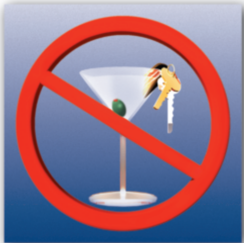
Don't Drink and Drive Symbol

Drinking and driving is a high-risk behaviour that can have serious consequences for you, your passengers, and other motorists or pedestrians. Alcohol is absorbed directly into the blood stream. This means that alcohol-induced impairment begins with the first drink. Legal impairment is defined as having a blood-alcohol content (BAC) of .08 per cent or more. However you can be charged and convicted below this level if you show other symptoms of impairment.